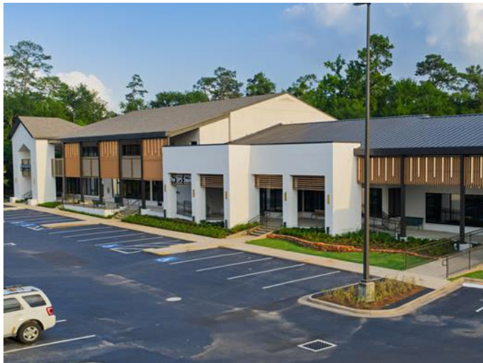
Grogan's Mill Village The Woodlands, TX

Grogan's Mill Village Center is a façade remodel of a 32,200-square-foot adaptive reuse renovation, a recipient of a Development of Distinction award from the Urban Land Institute, located within the original village of Grogan's Mill in The Woodlands, Texas. The two-level retail and office center, spanning more than 600 linear feet of façade, underwent a comprehensive architectural revitalization designed to modernize its appearance,