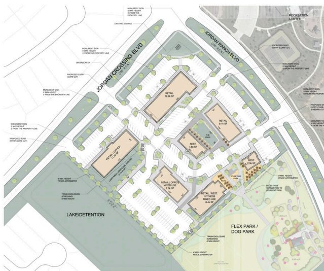
The Bend in Jordan Ranch Fulshear, TX

The Bend at Jordan Ranch is a 55,000 SF multi-building mixed-use development located in the community of Fulshear. Key features include A Placemaking development, Modern farmhouse-style architecture, patio areas and central lawn, Open spaces integrated with Community Center and public park that is designed to support future retail and restaurant tenants.