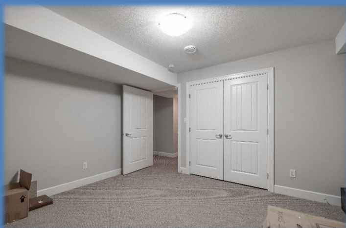
Possible Third Bedroom