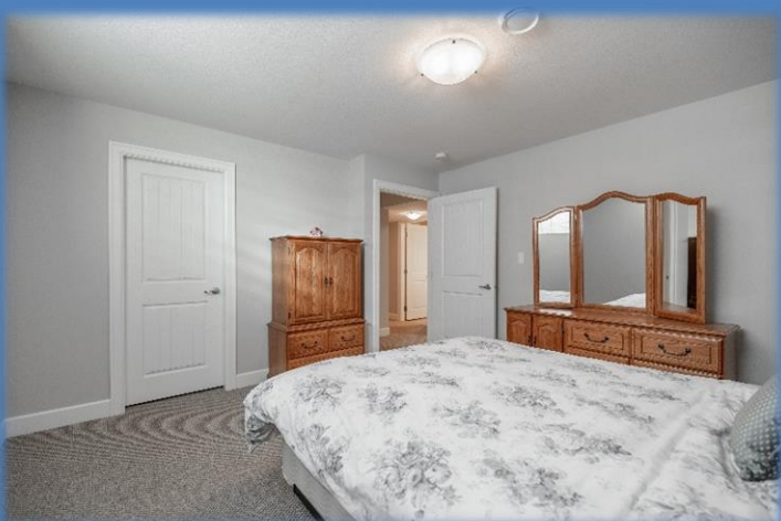
Second Bedroom Room