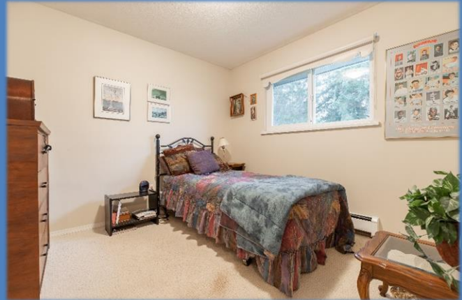
• 2 nd Bedroom