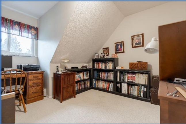
• 3rd Bedroom