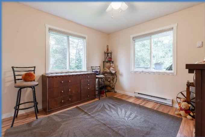
• Master Bedroom in Suite