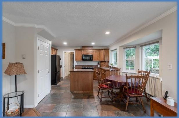
• Eating Area