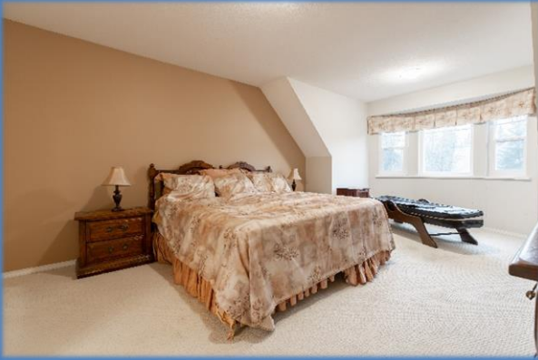
• Master Bedroom