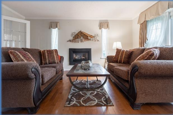
• Living Room