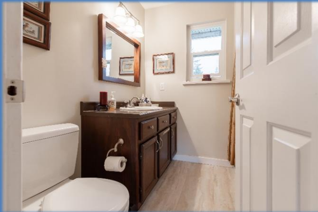
• Master Bedroom En-suite