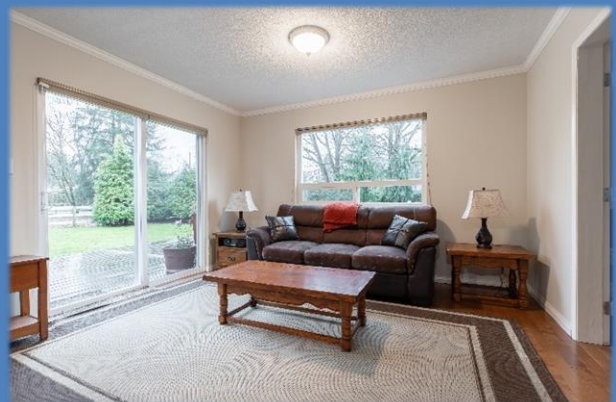
• Family Room