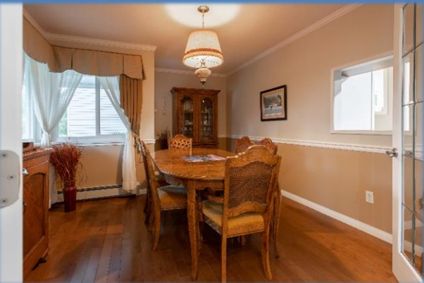
• Dining Room