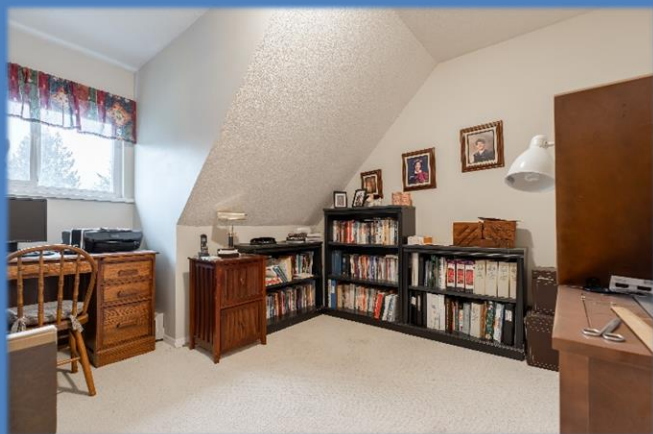
• 3 rd Bedroom