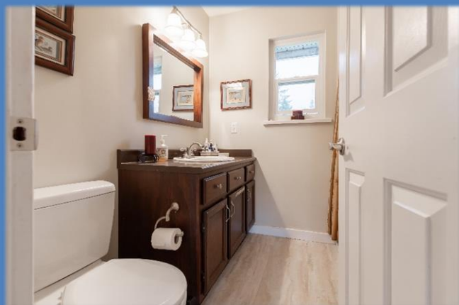
• Master Bedroom En-suite