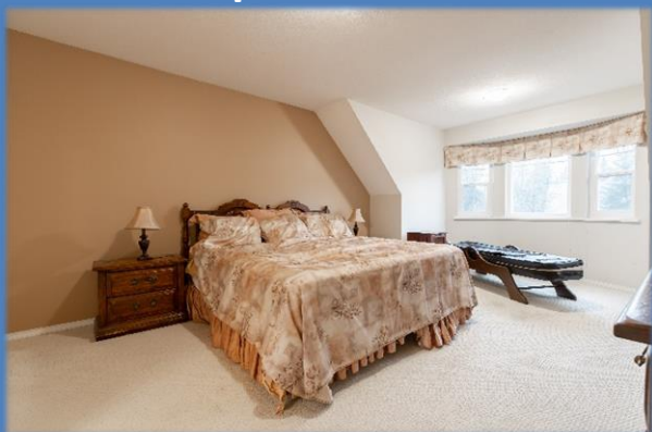
• Master Bedroom