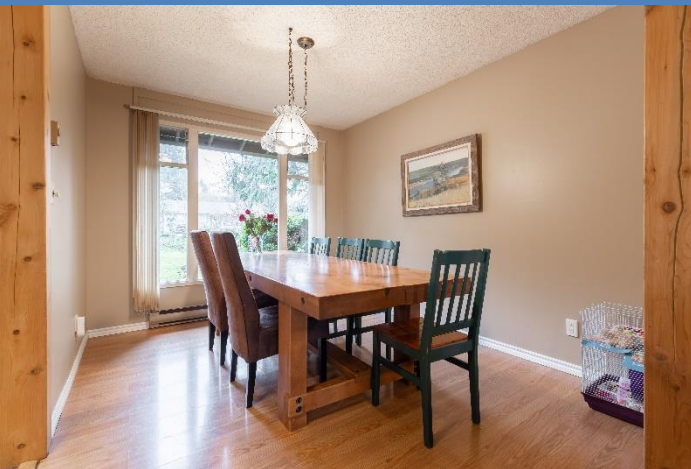
• Dining Room