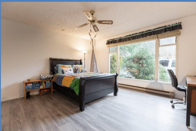
• 4th Bedroom