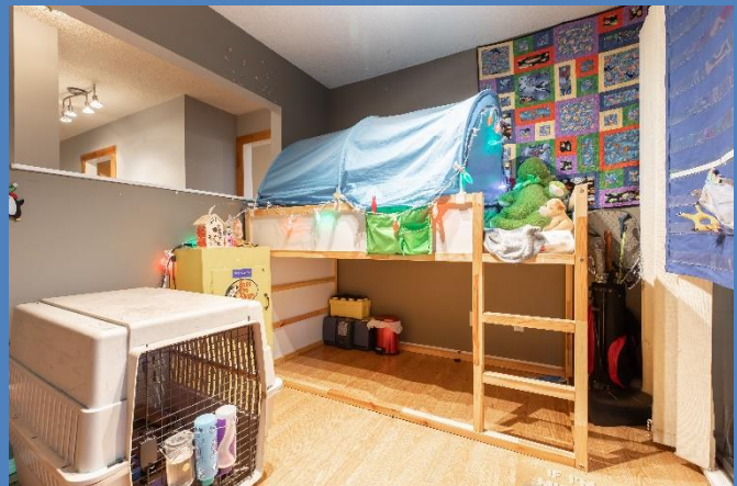
• Flex Room (Currently used as a 5 th Bedroom)