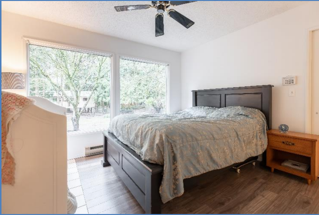
• Master Bedroom