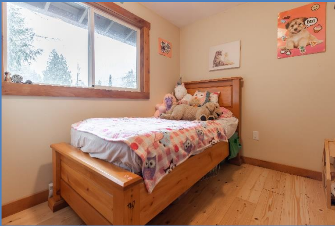
• 2nd Bedroom