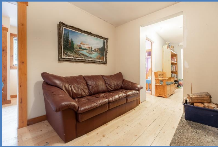
• Family Room