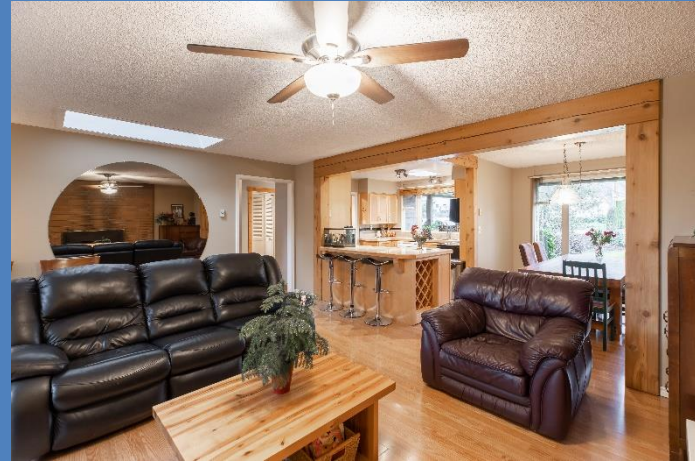
• Living Room