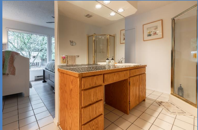
• Master Bedroom En-suite