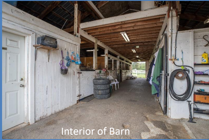
Interior of Barn