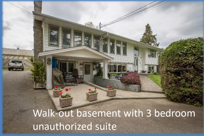
Walk-out basement with 3 bedroom unauthorized suite