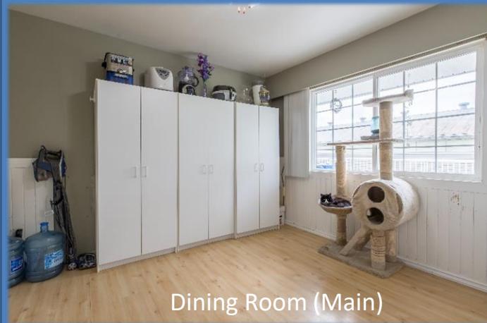
Dining Room (Main)