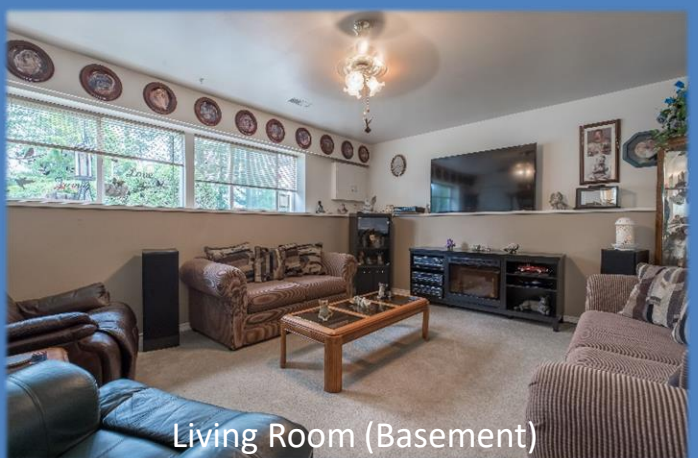
Living Room (Basement)