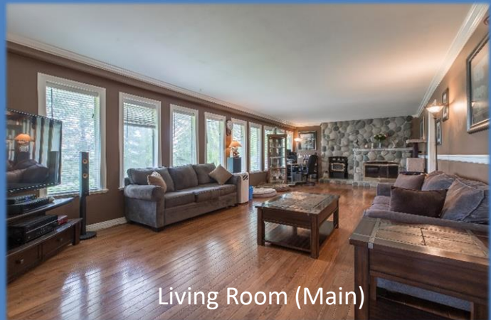
Living Room (Main)