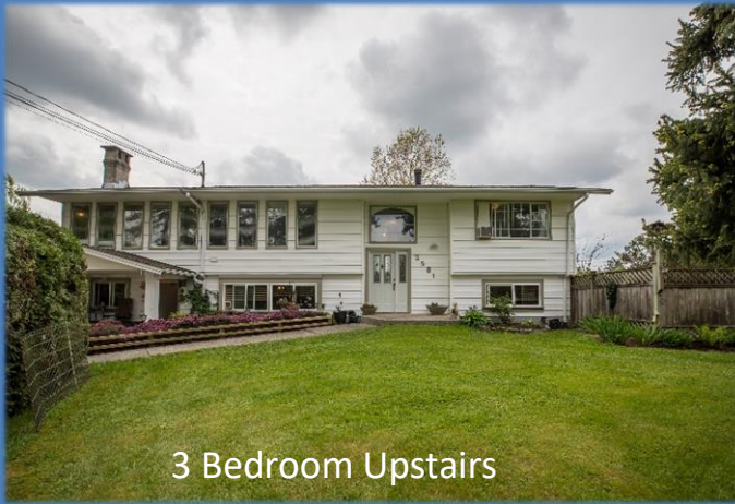
3 Bedroom Upstairs