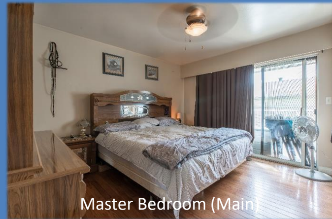
Master Bedroom (Main)