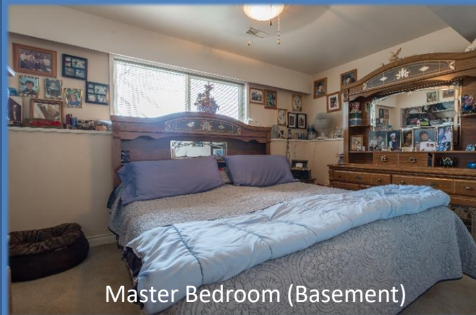
Master Bedroom (Basement)