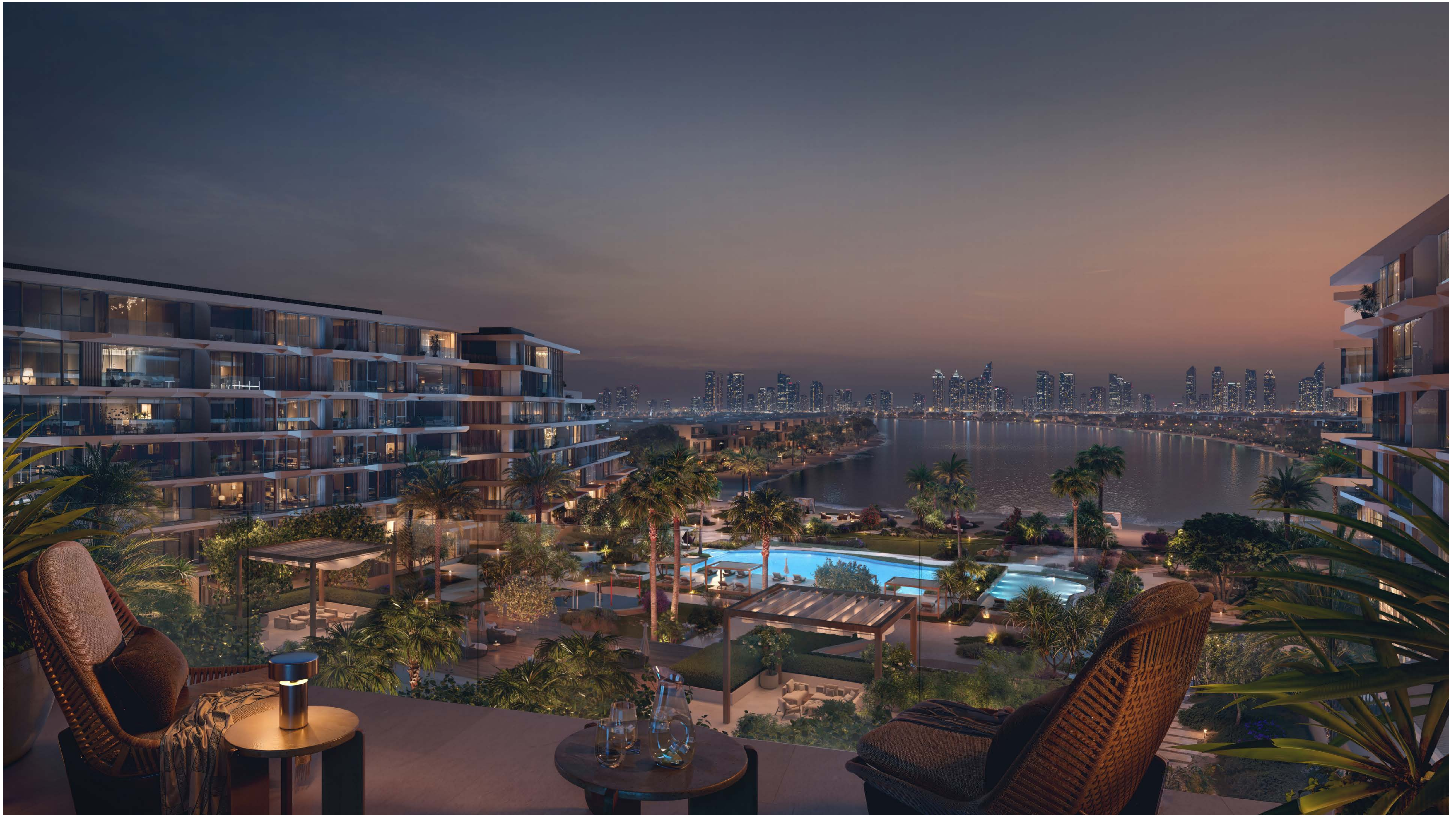
3-BEDROOM | BALCONY