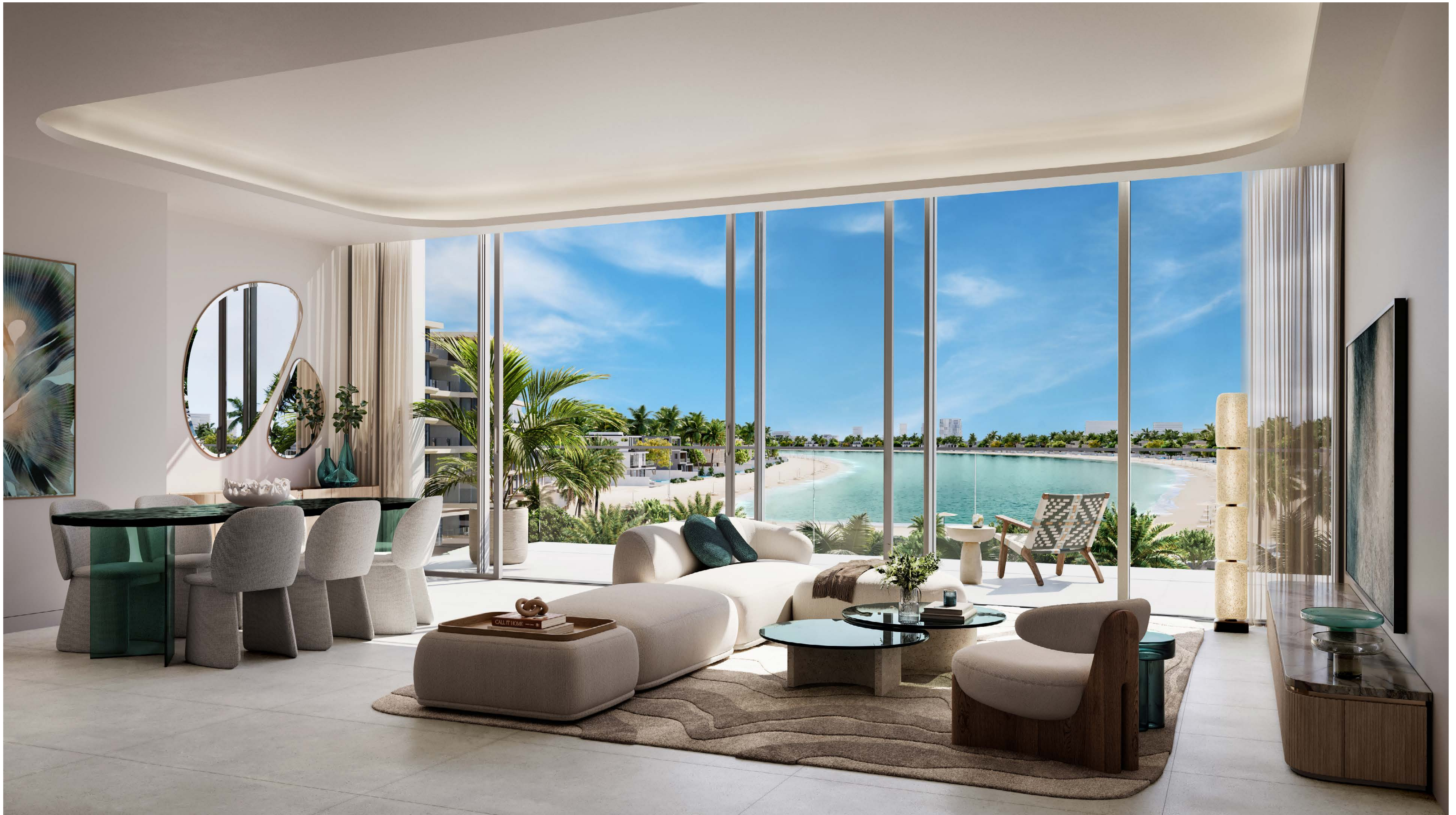
3-BEDROOM | DINING AND LIVING ROOM