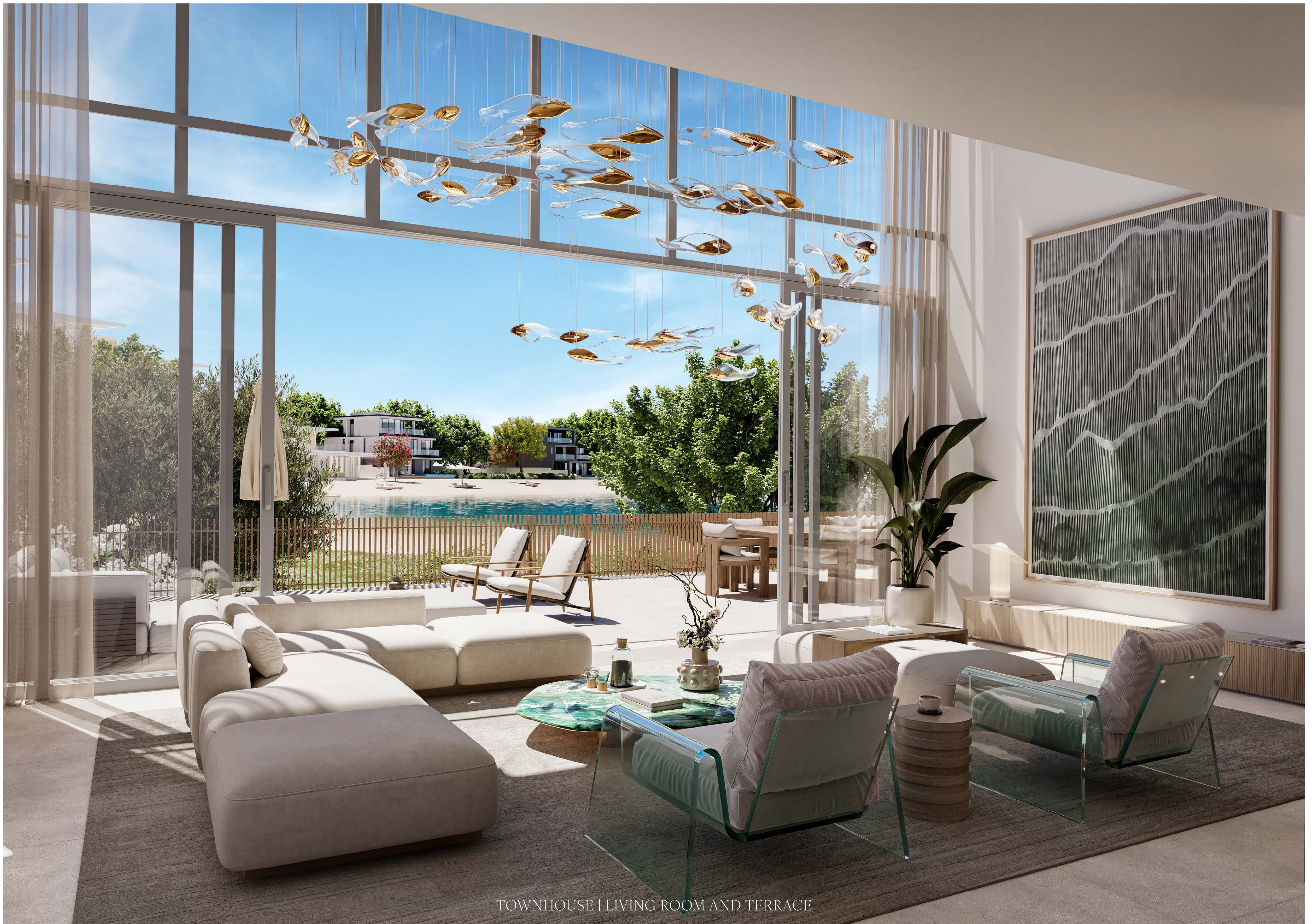
TOWNHOUSE | LIVING ROOM AND TERRACE