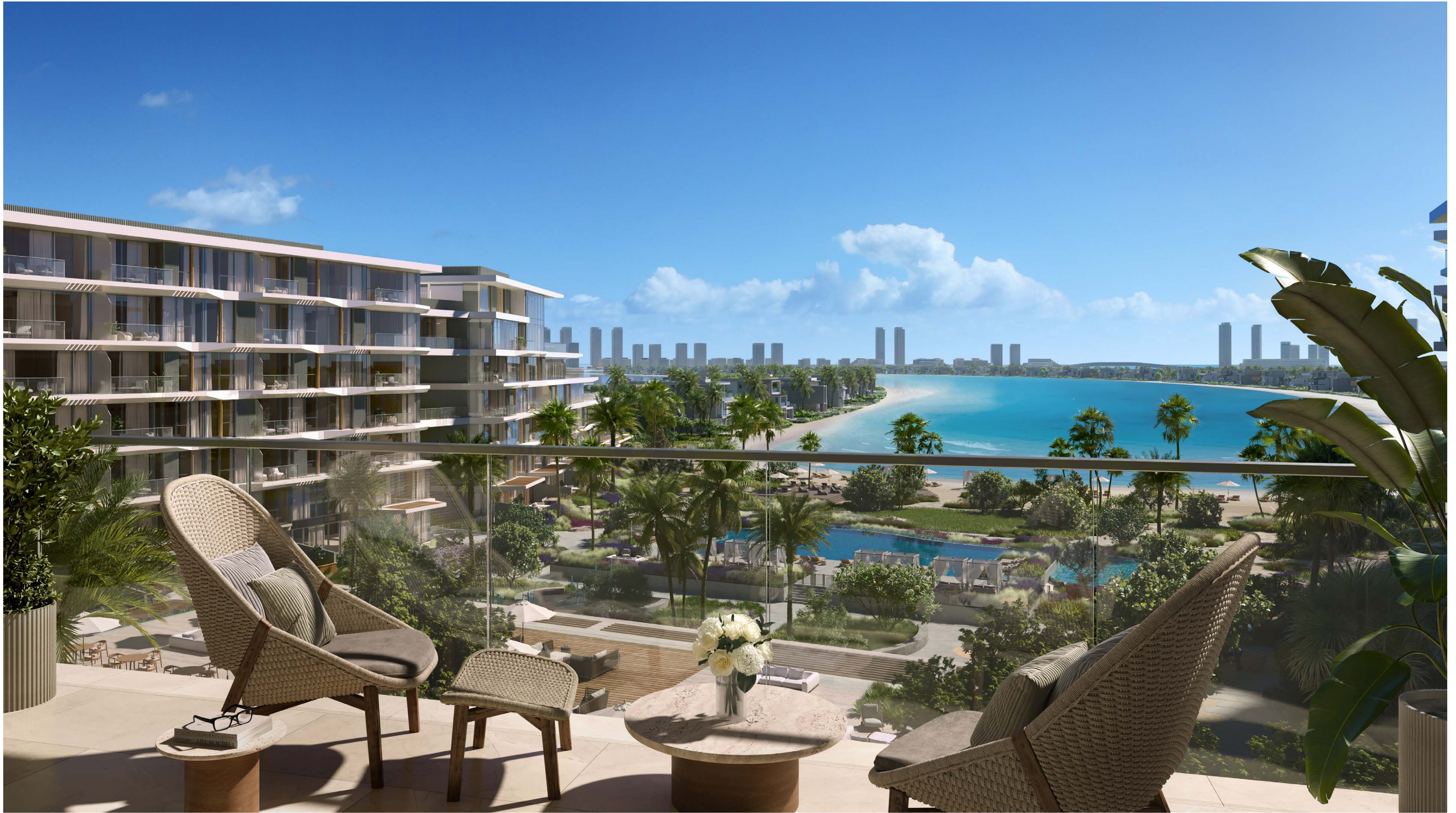
3-BEDROOM | BALCONY