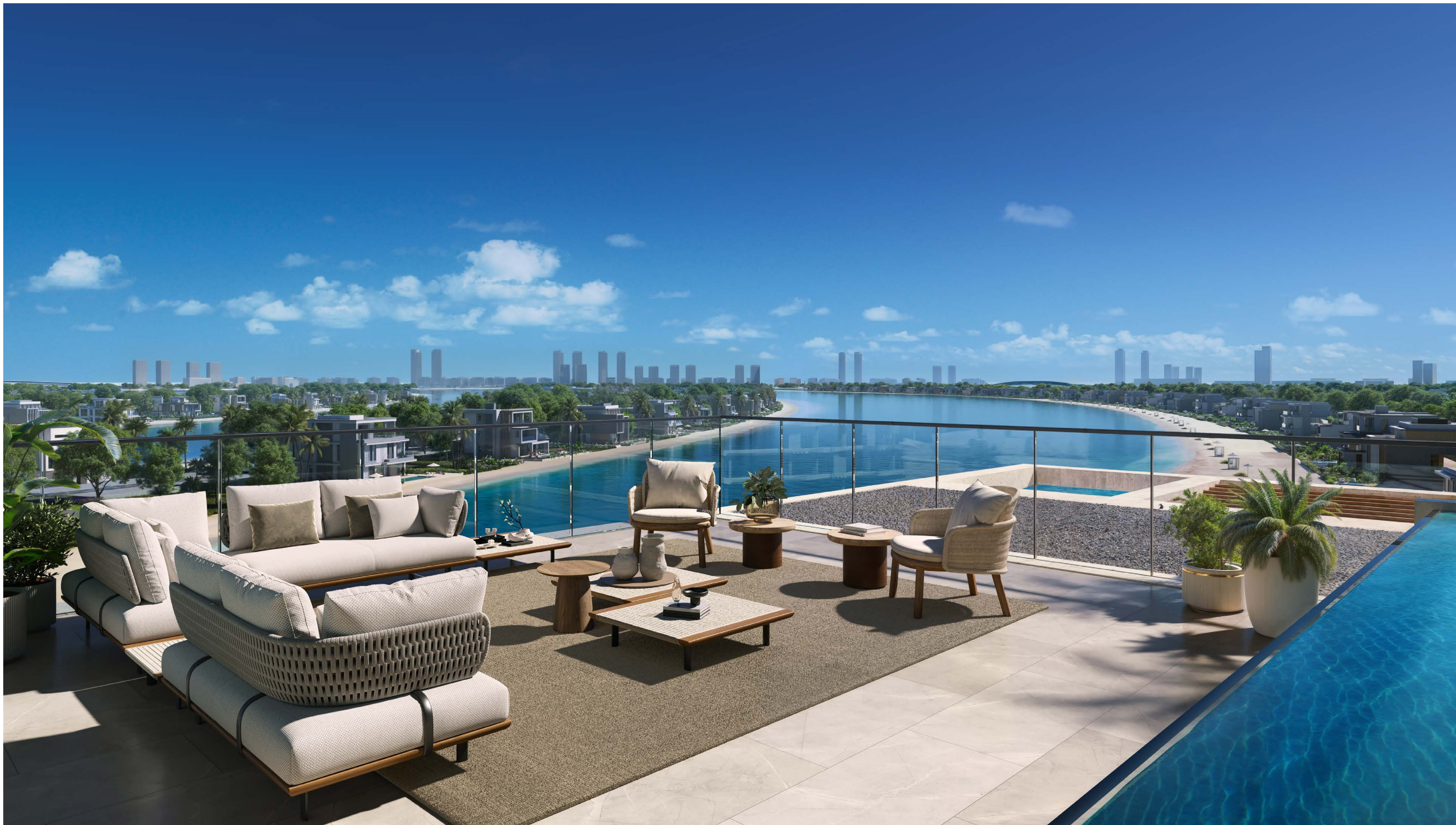
PENTHOUSE | TERRACE