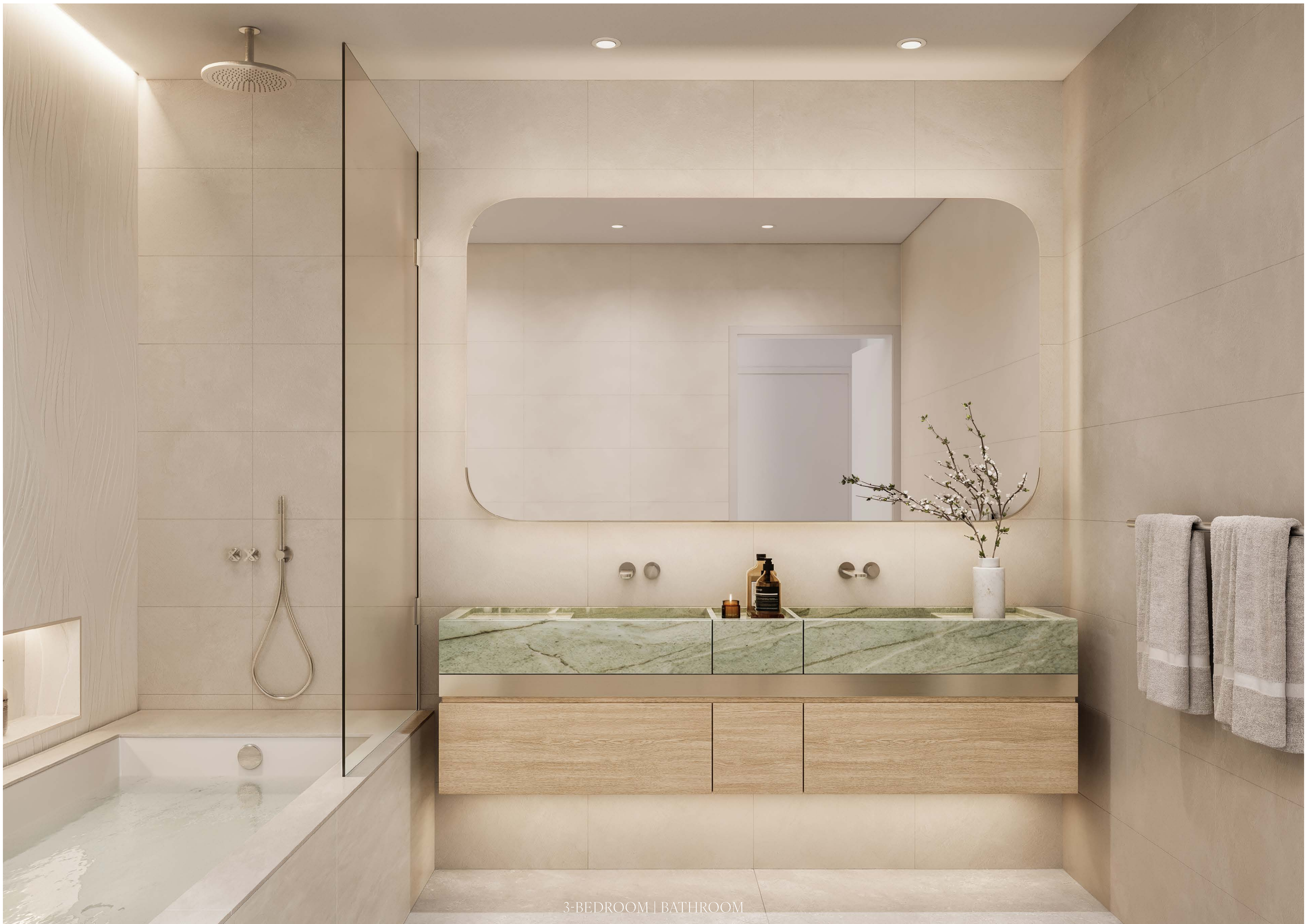
3-BEDROOM | BATHROOM