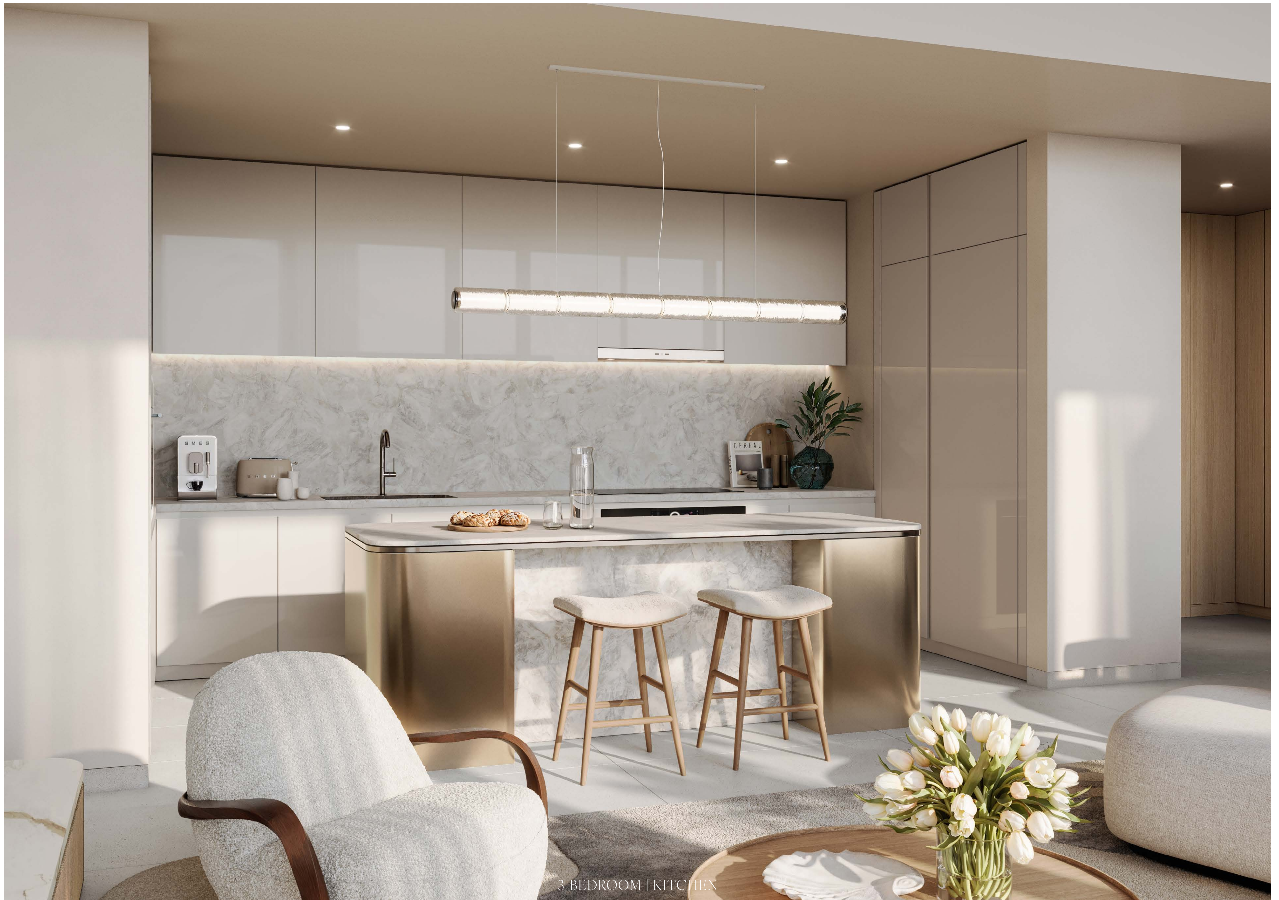
3-BEDROOM | KITCHEN