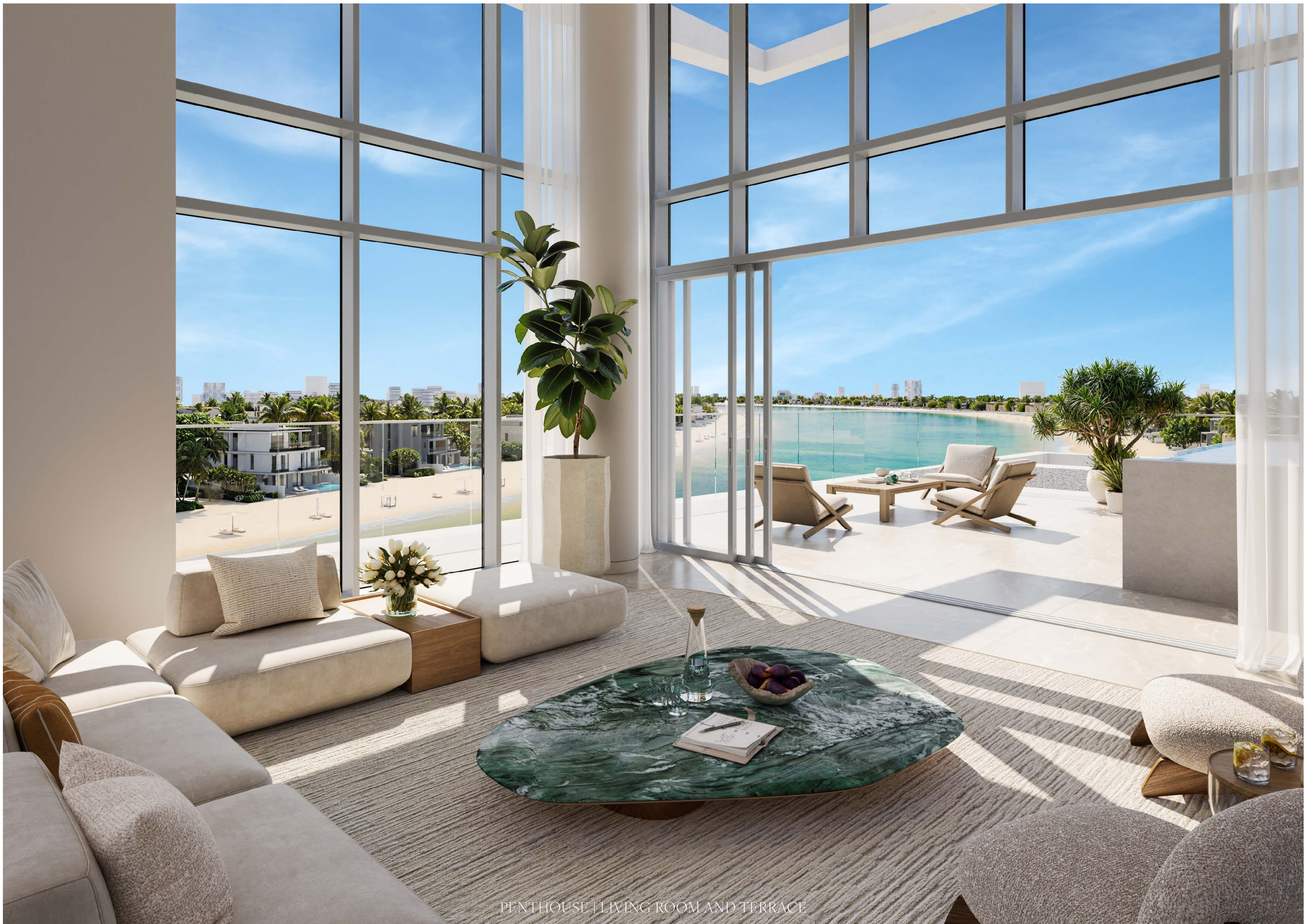
PENTHOUSE | LIVING ROOM AND TERRACE