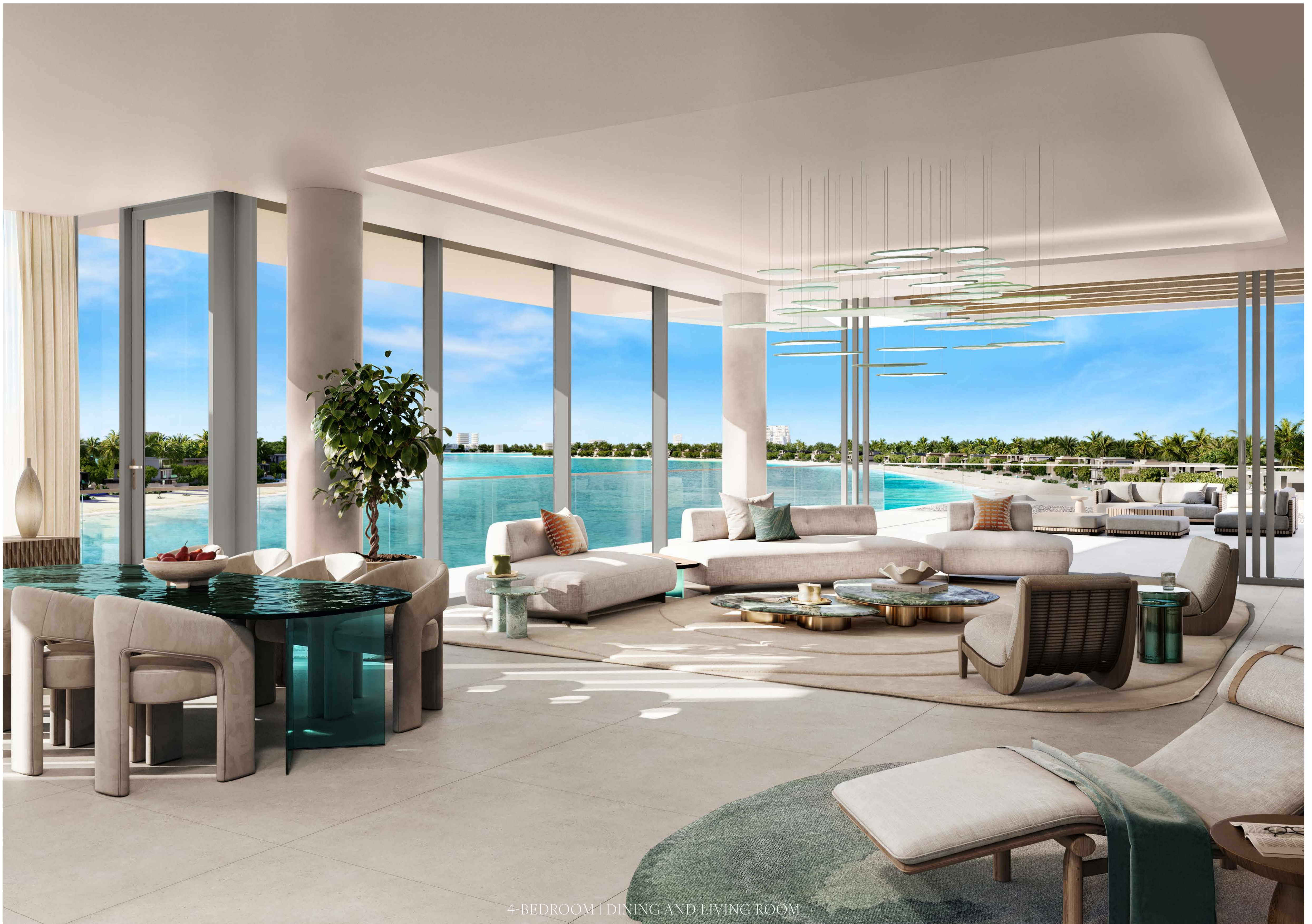
4-BEDROOM | DINING AND LIVING ROOM