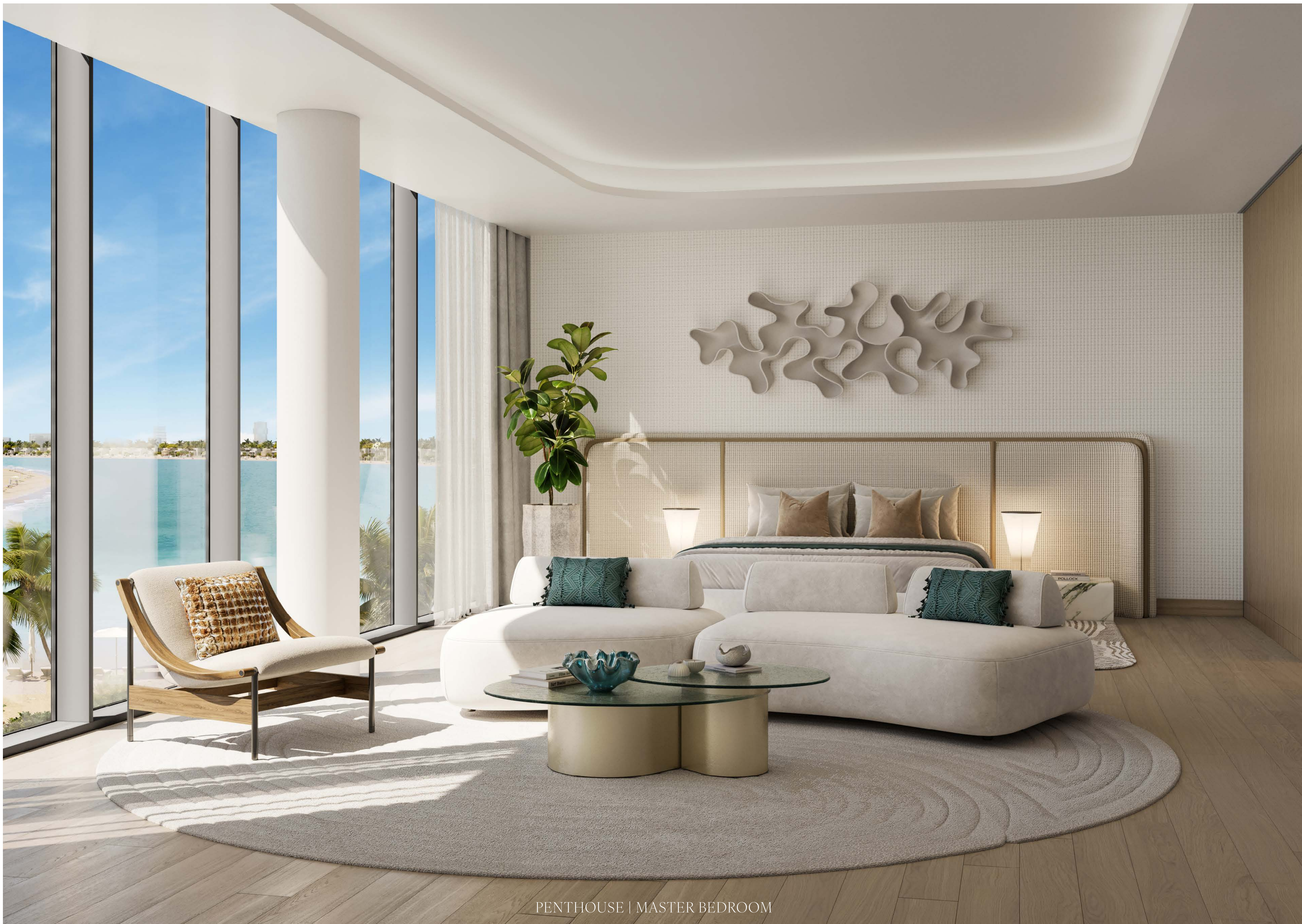
PENTHOUSE | MASTER BEDROOM