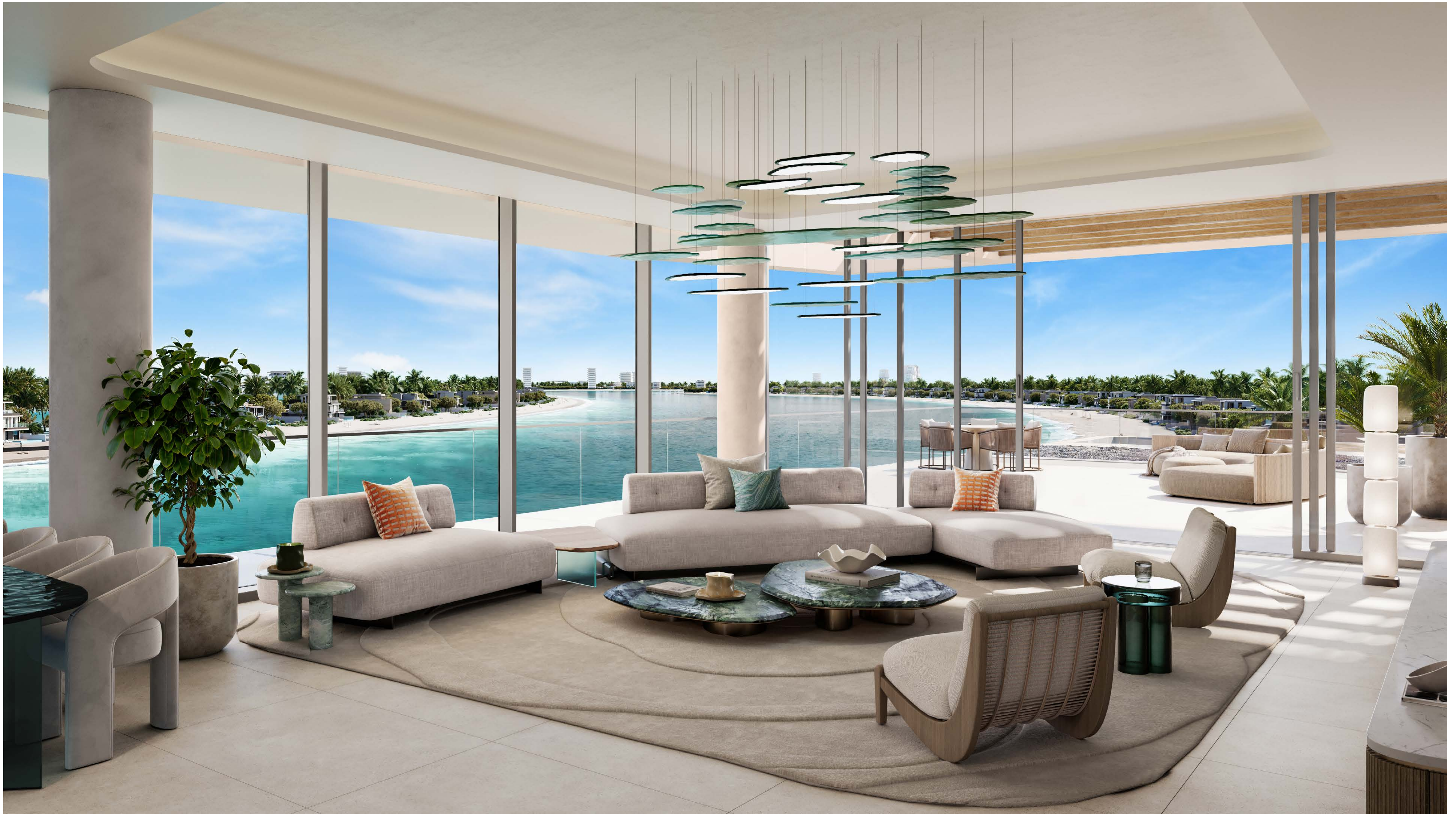
4-BEDROOM | LIVING ROOM