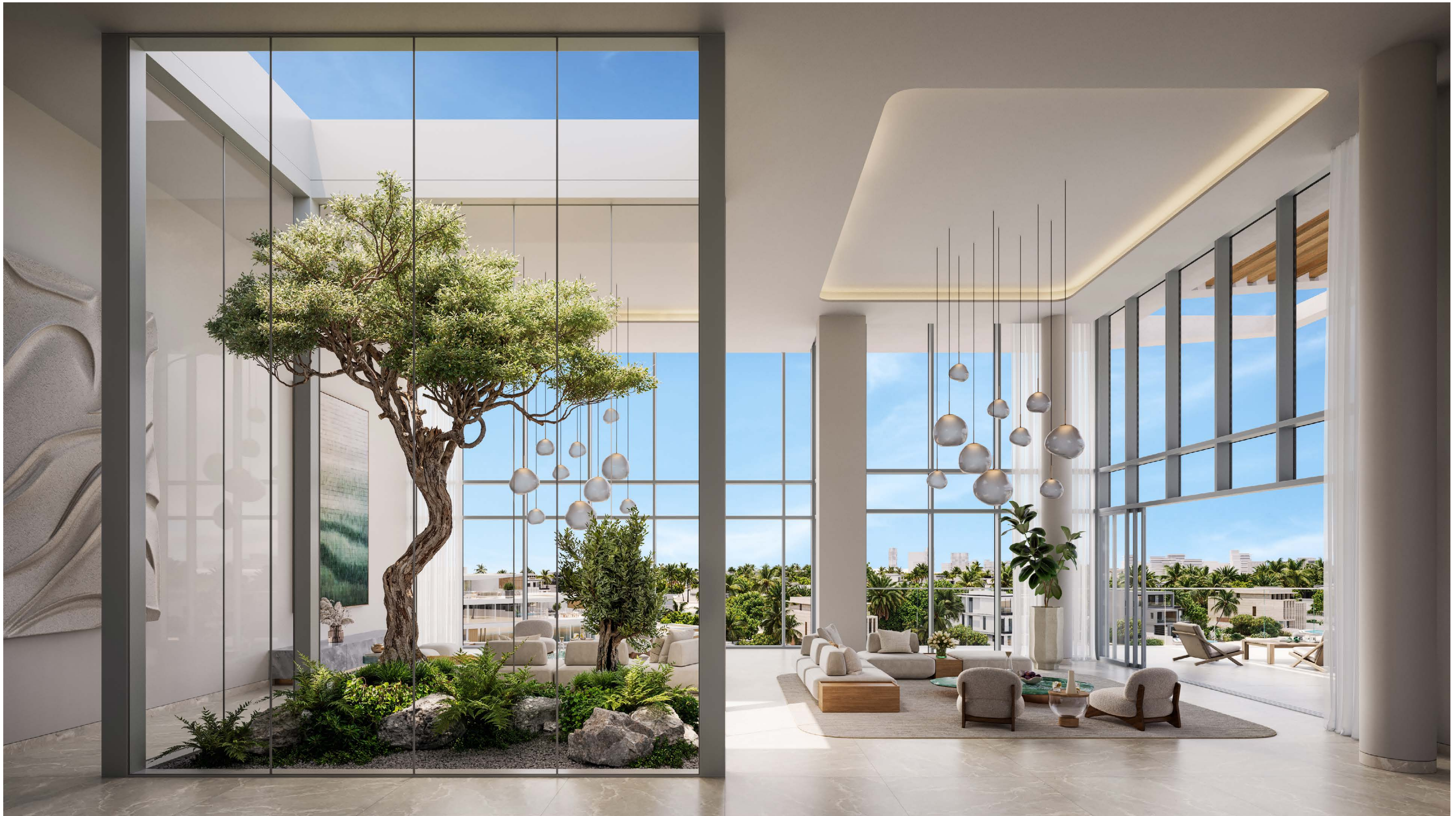
PENTHOUSE | LIVING ROOM AND COURTYARD