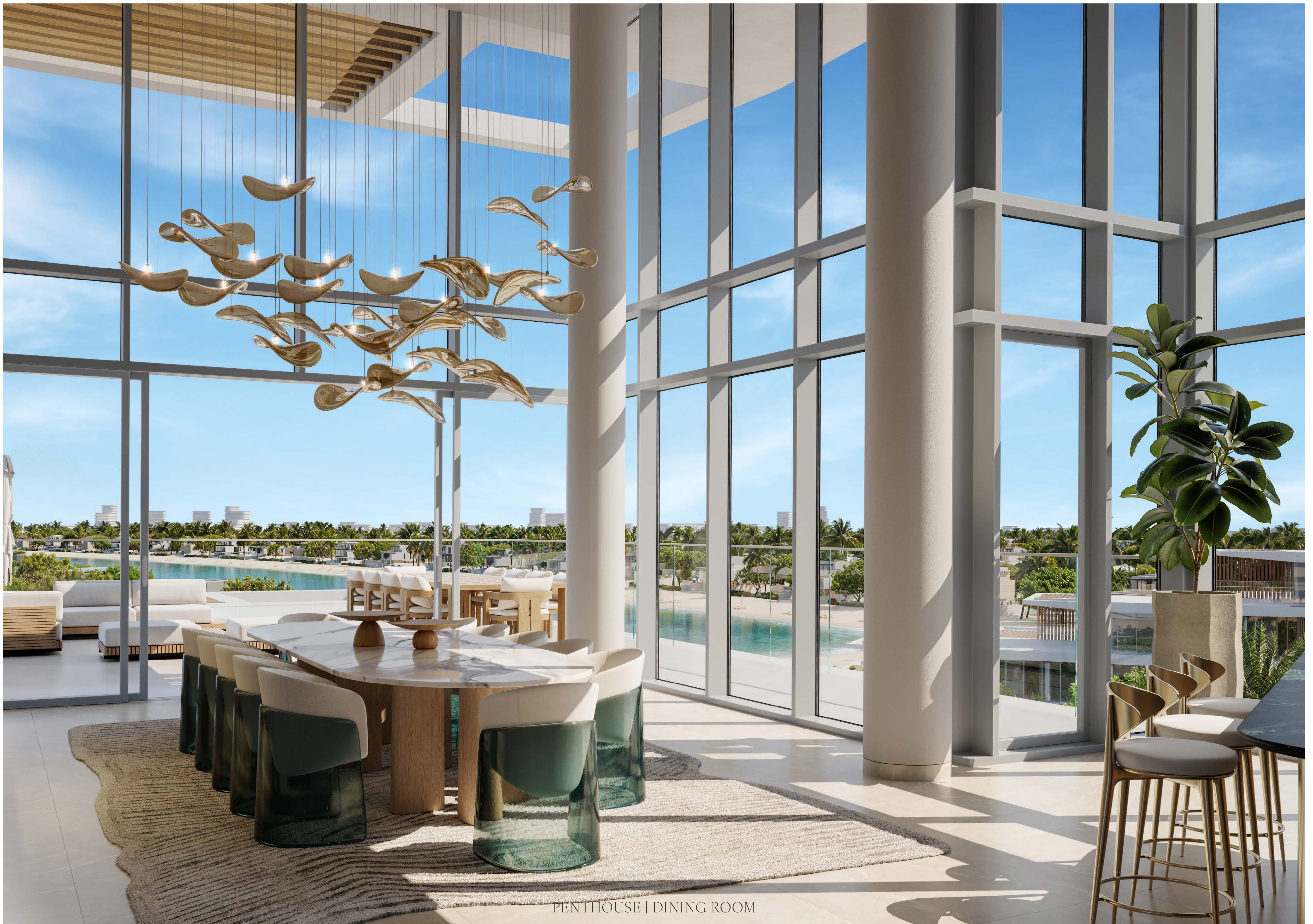
PENTHOUSE | DINING ROOM