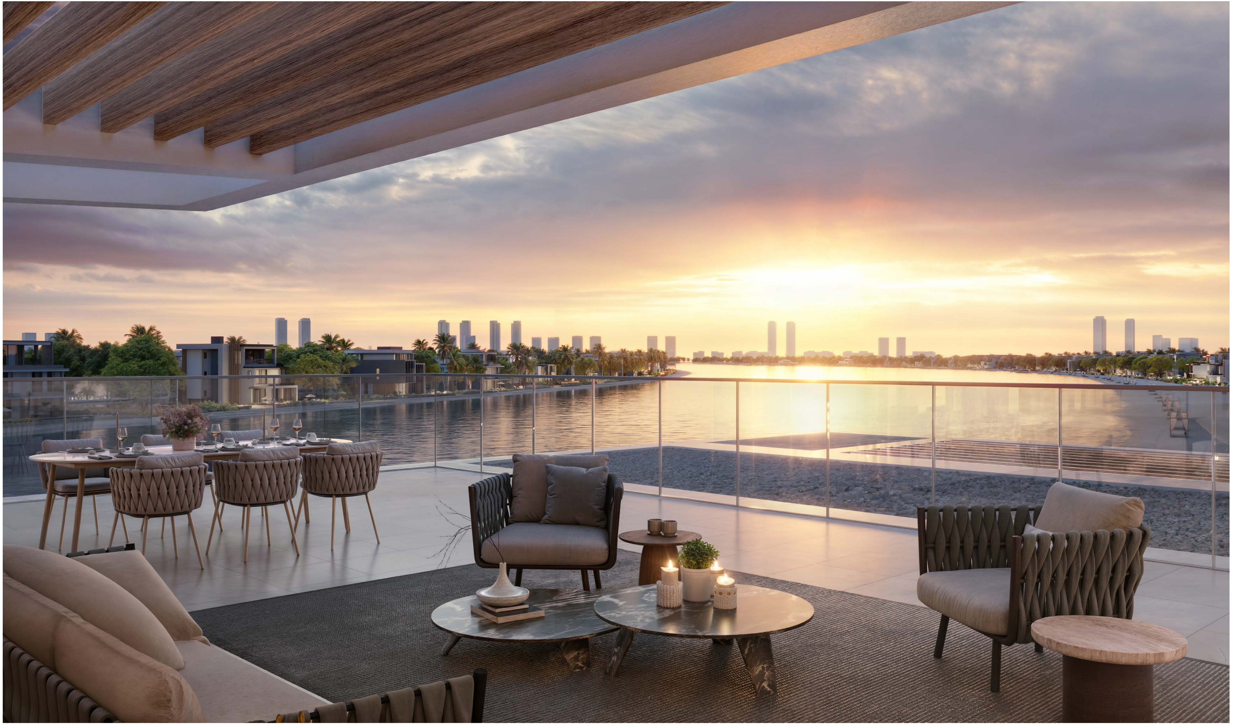
5-BEDROOM | TERRACE