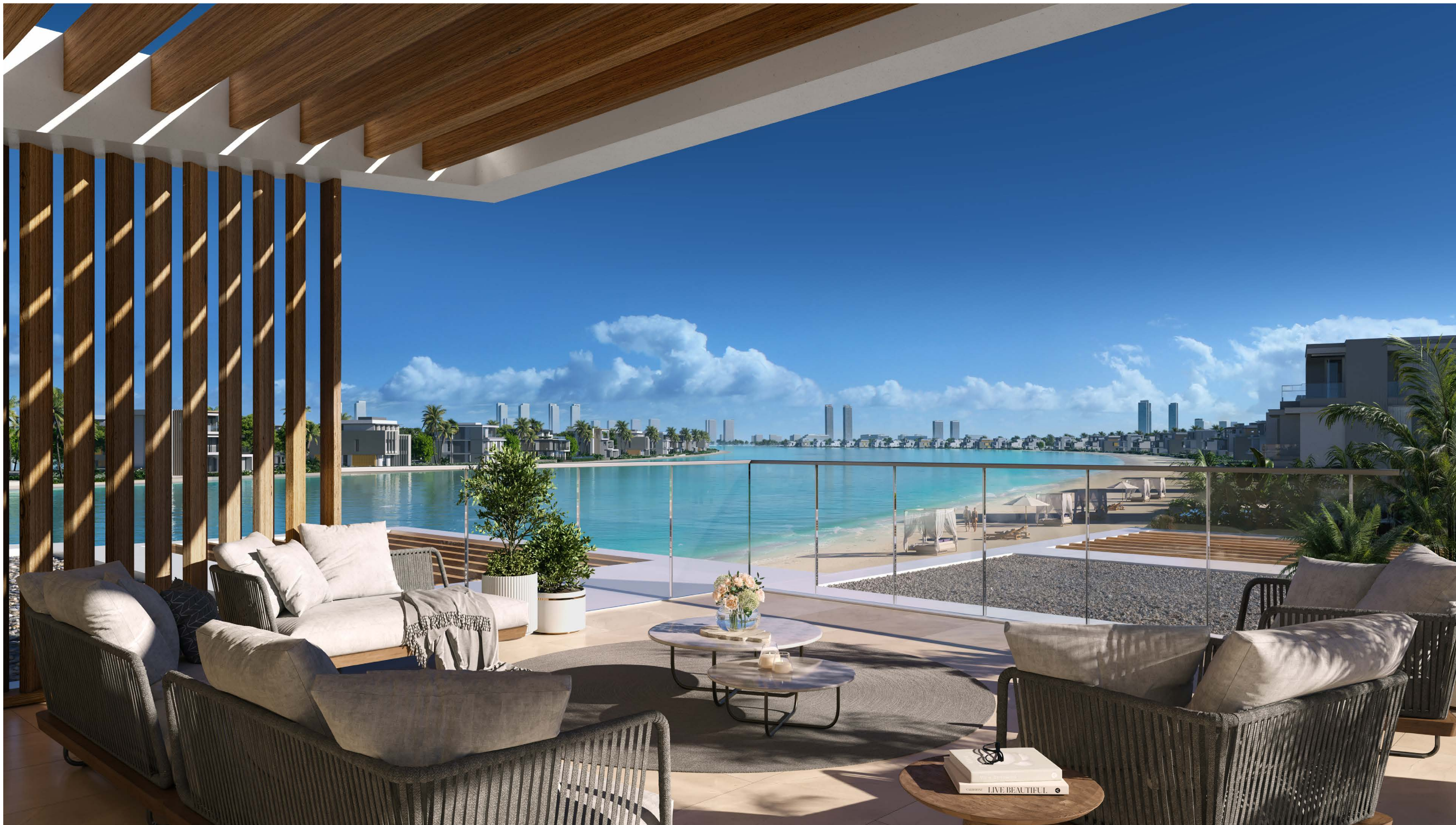
3-BEDROOM | TERRACE