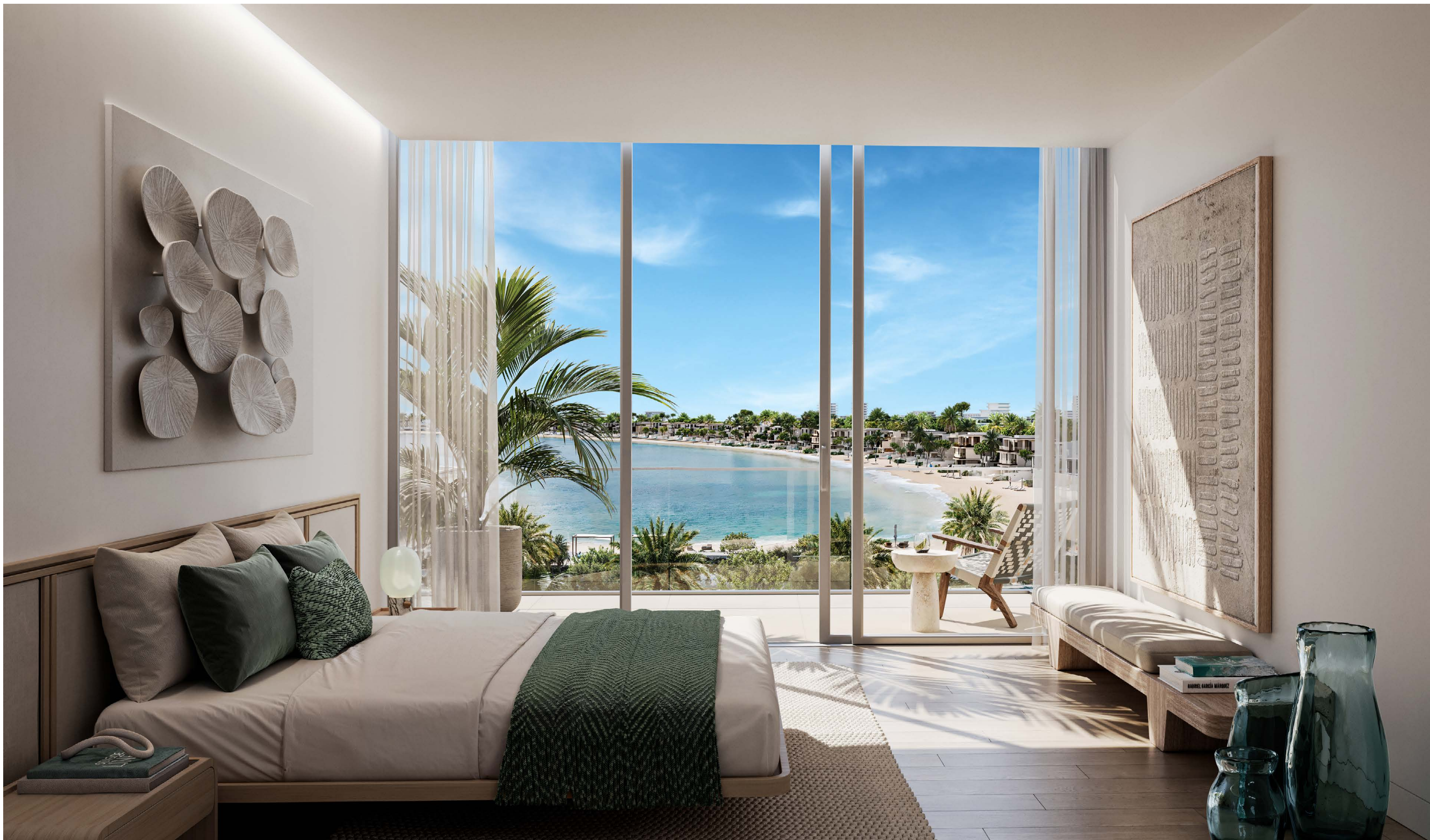
3-BEDROOM | MASTER BEDROOM