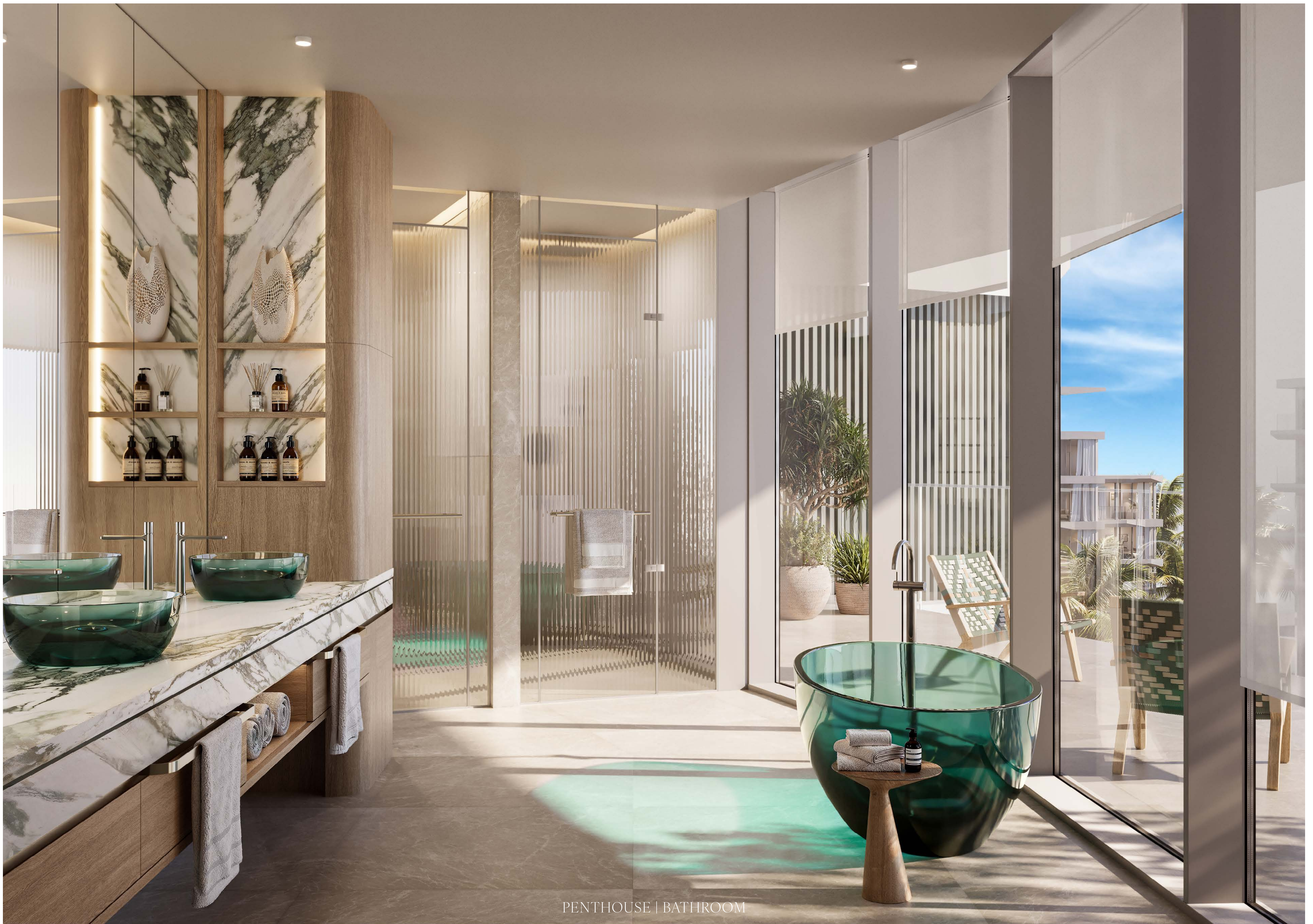
PENTHOUSE | BATHROOM