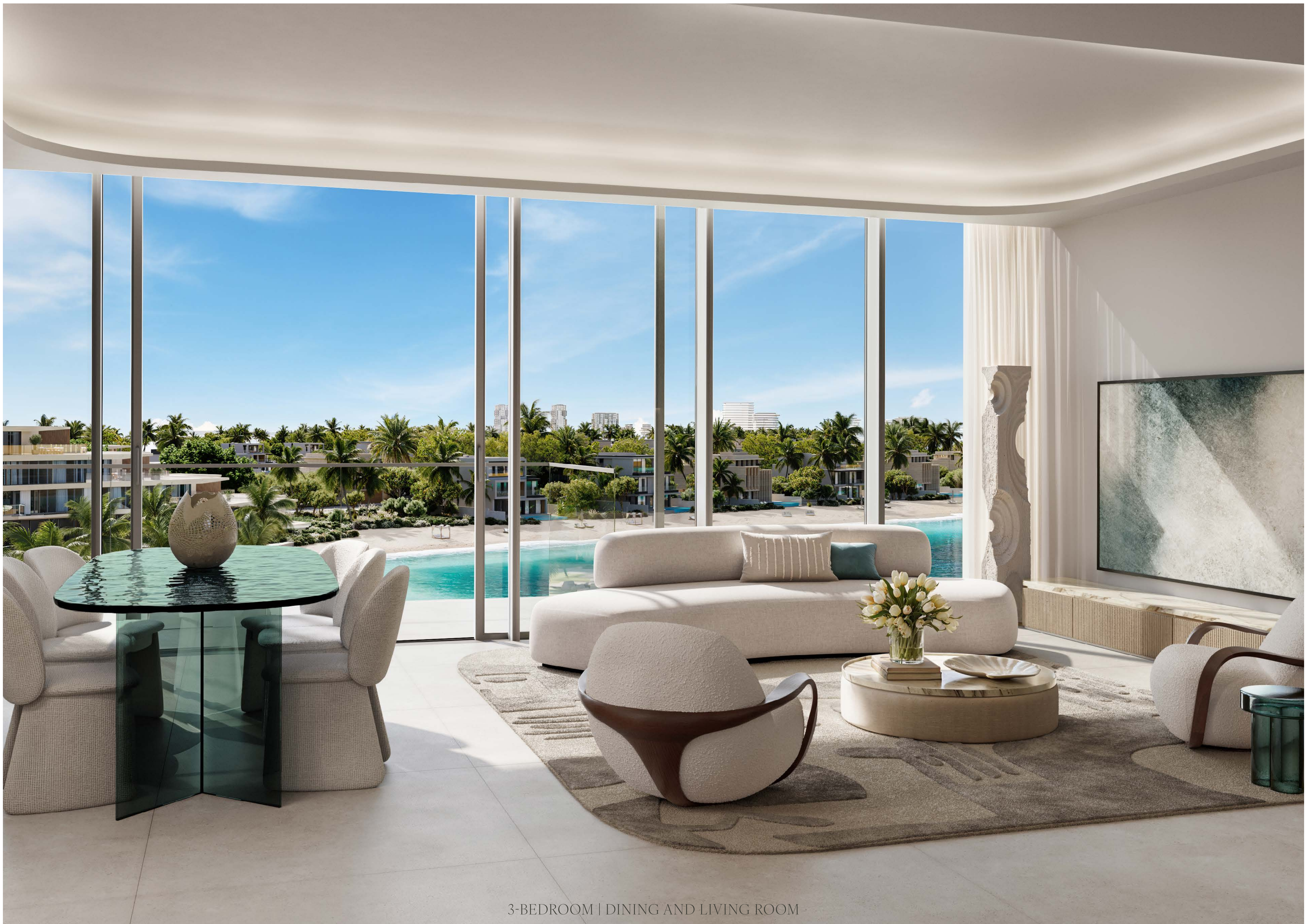
3-BEDROOM | DINING AND LIVING ROOM