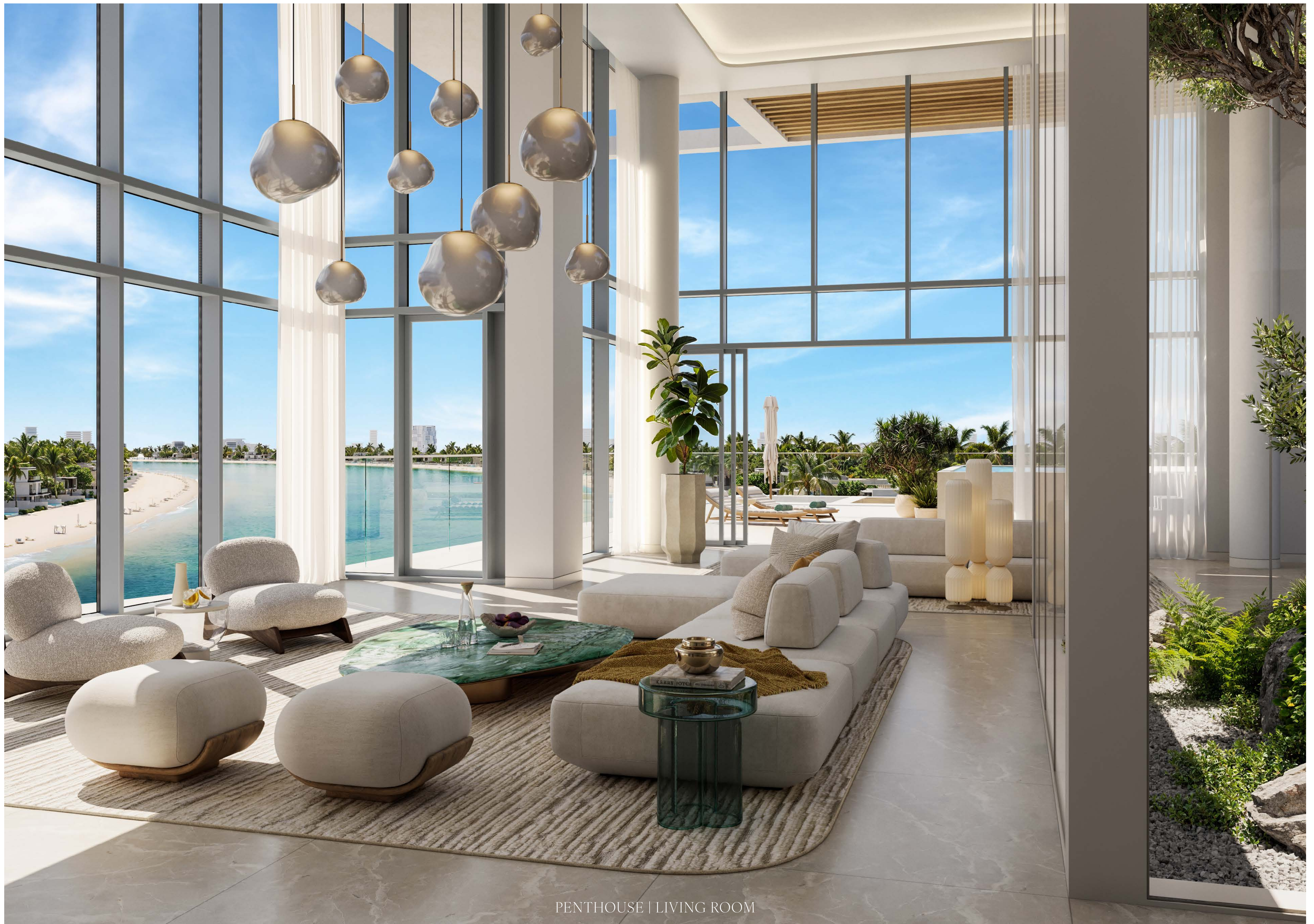
PENTHOUSE | LIVING ROOM