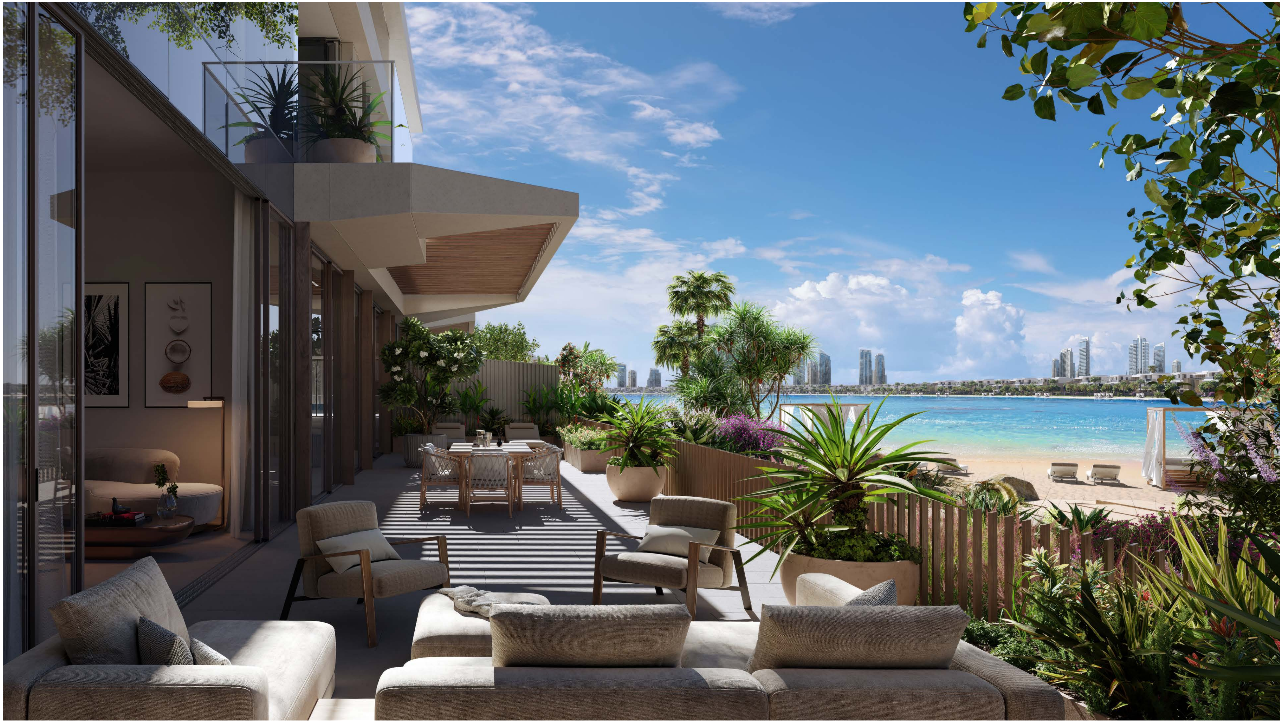
TOWNHOUSE | TERRACE