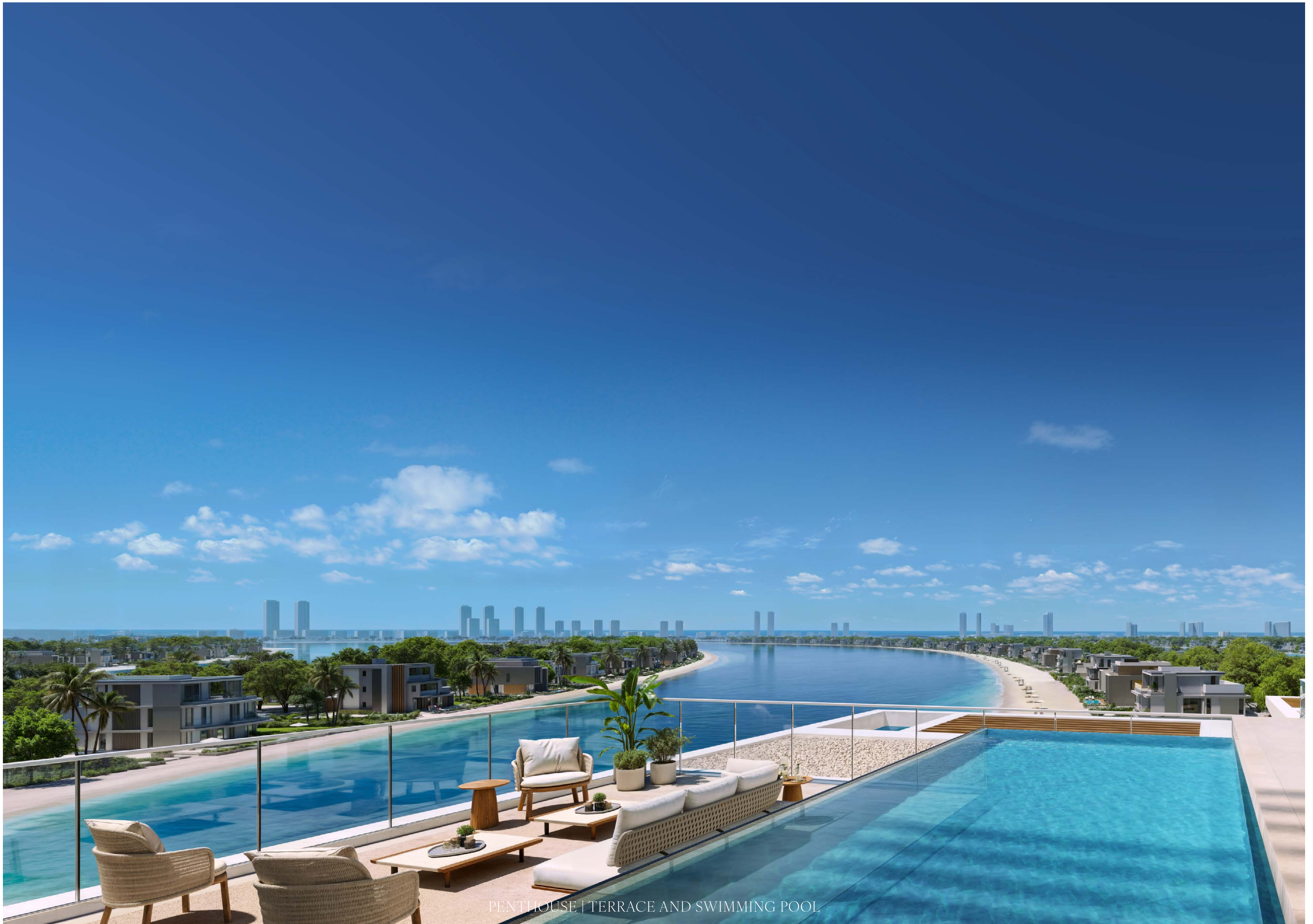
PENTHOUSE | TERRACE AND SWIMMING POOL