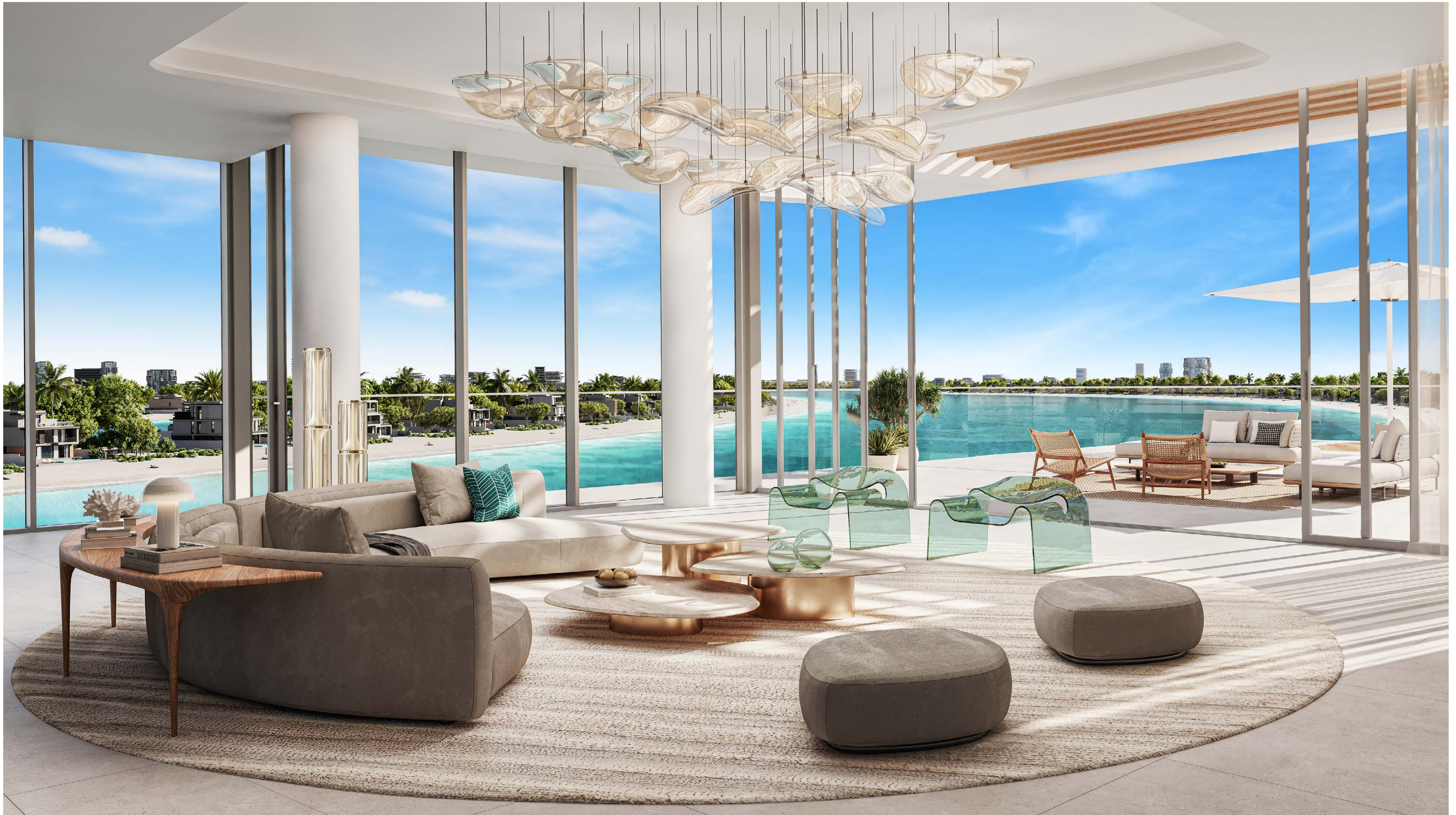
5-BEDROOM | LIVING ROOM AND TERRACE