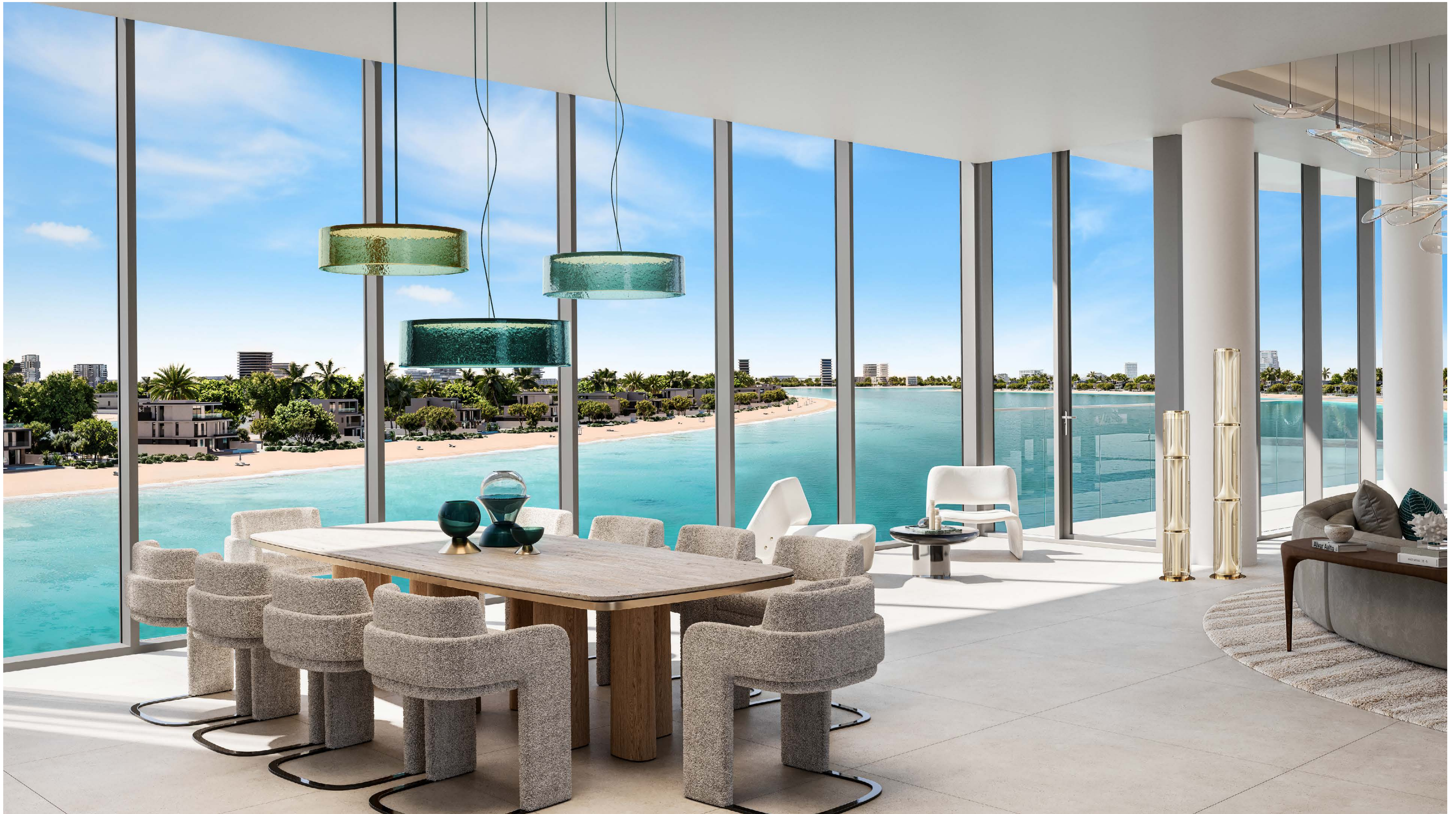
5-BEDROOM | DINING ROOM