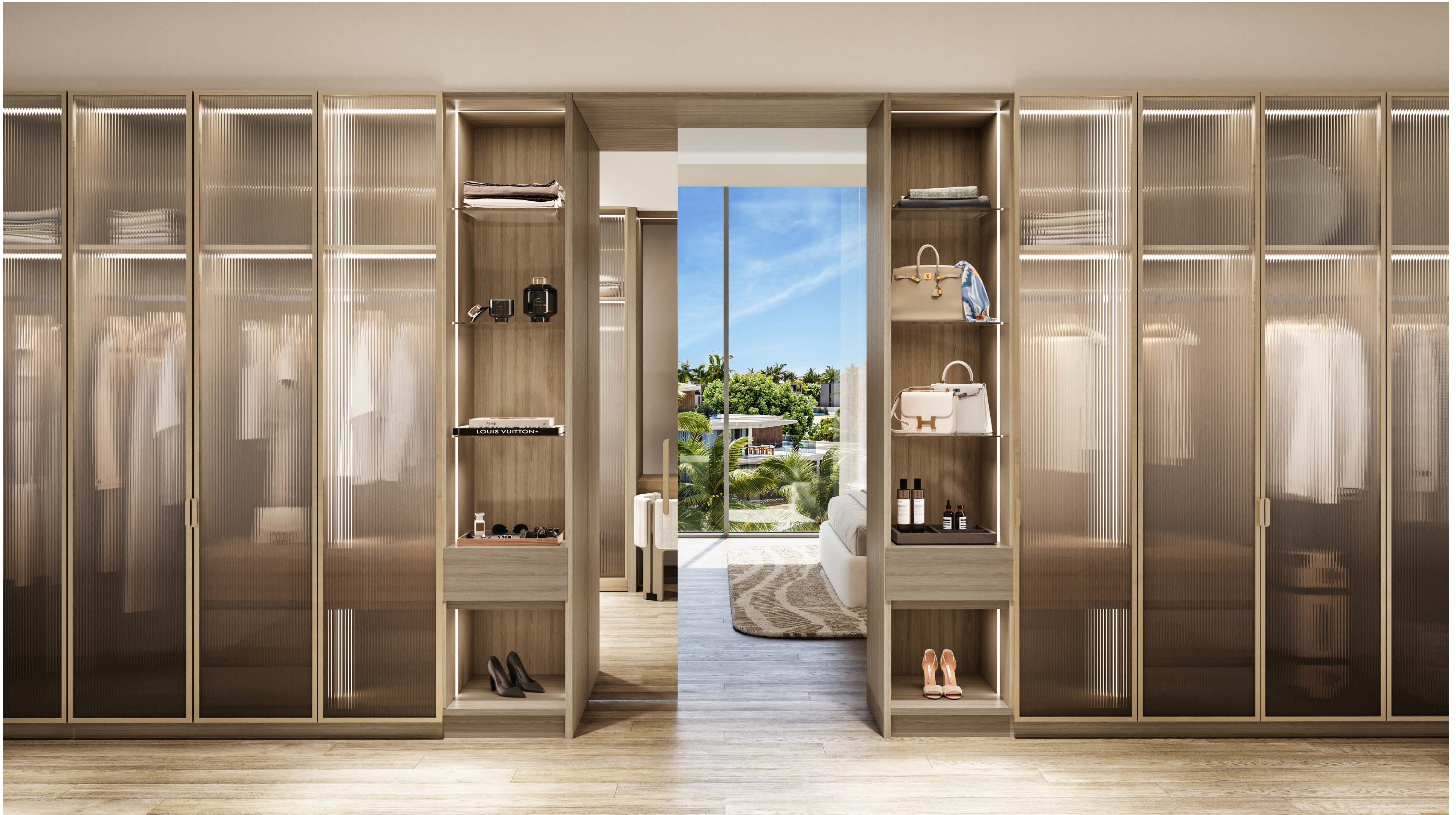
PENTHOUSE | WARDROBE