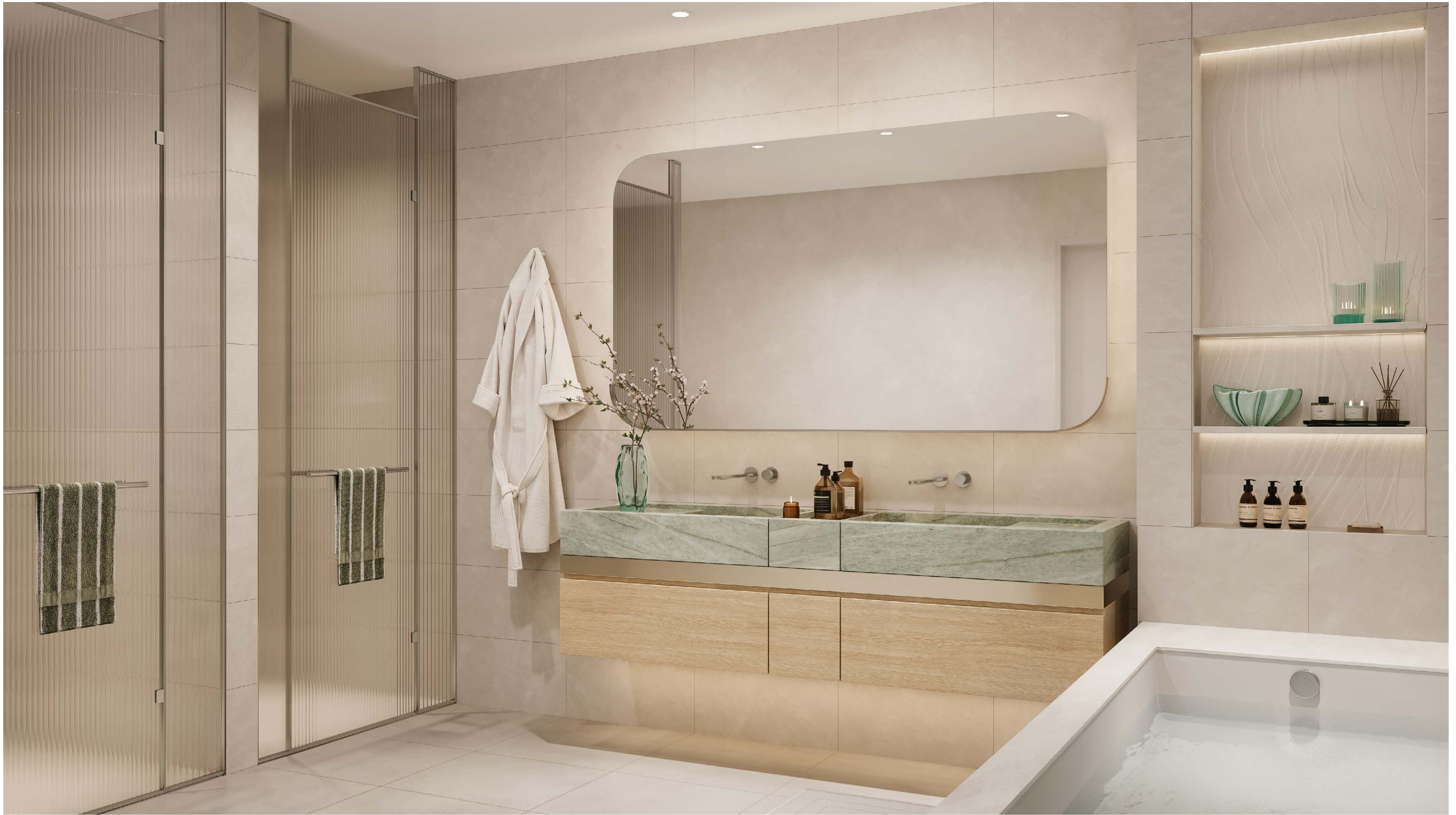
4-BEDROOM | BATHROOM