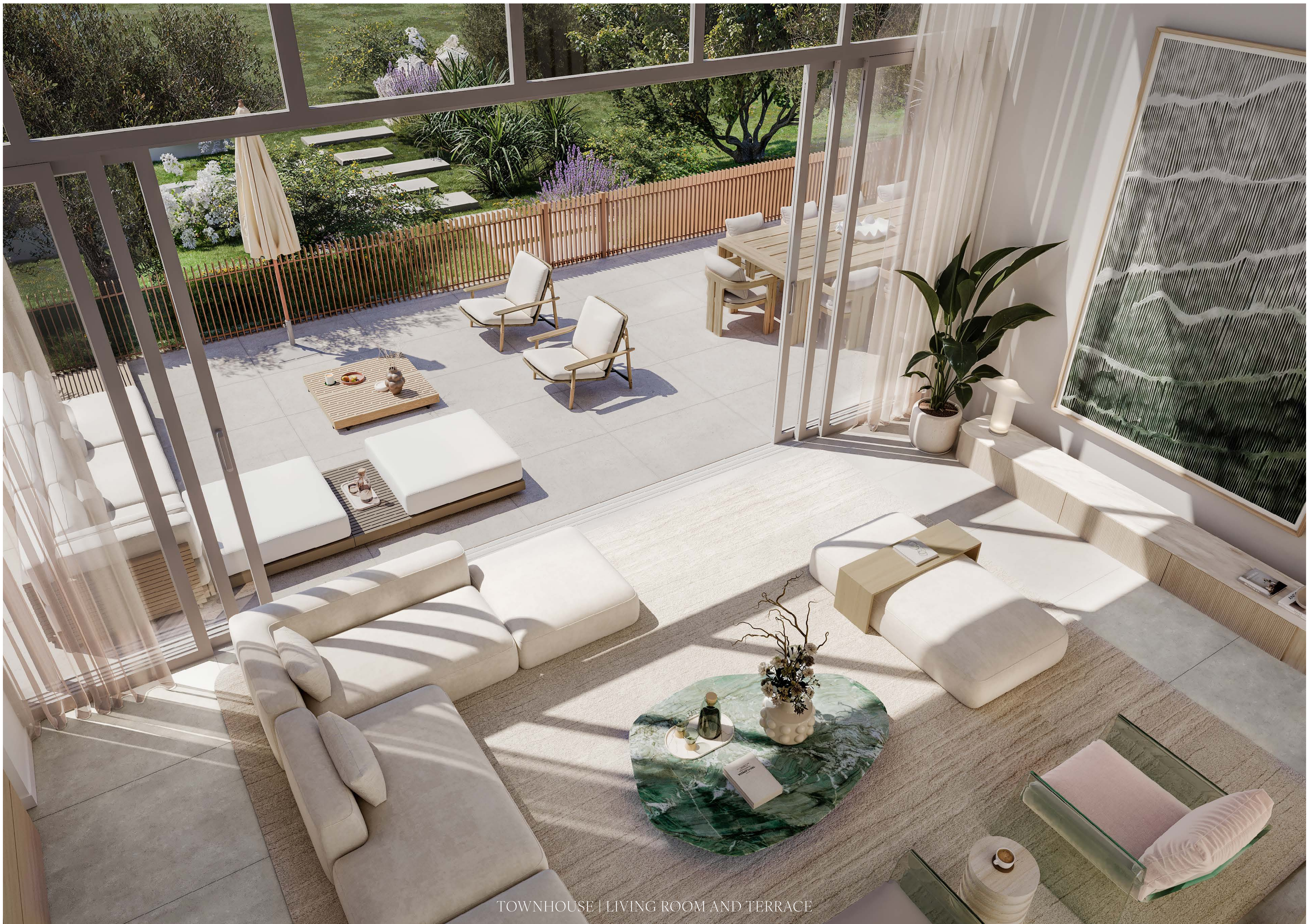
TOWNHOUSE | LIVING ROOM AND TERRACE