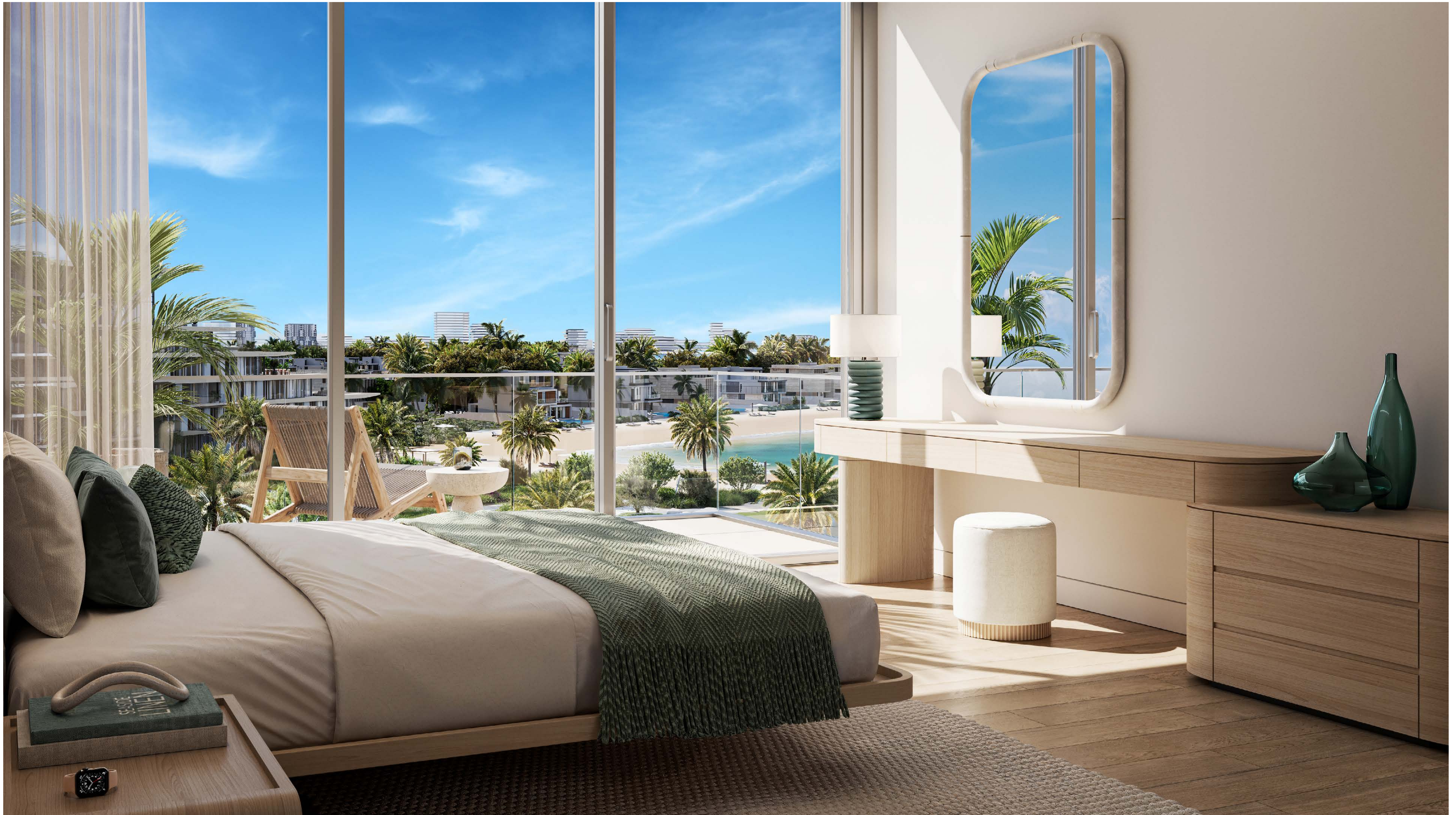
4-BEDROOM | MASTER BEDROOM