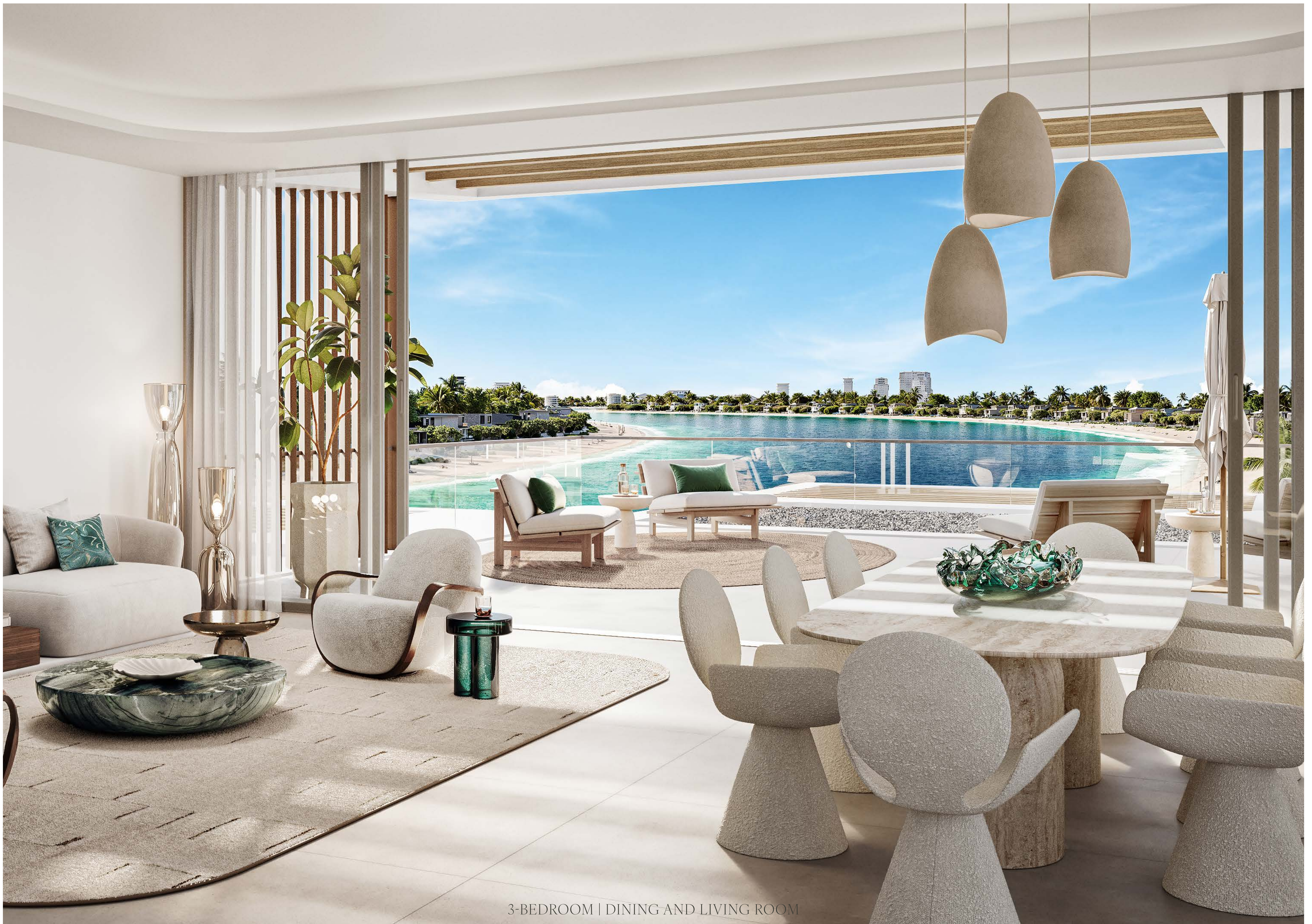
3-BEDROOM | DINING AND LIVING ROOM