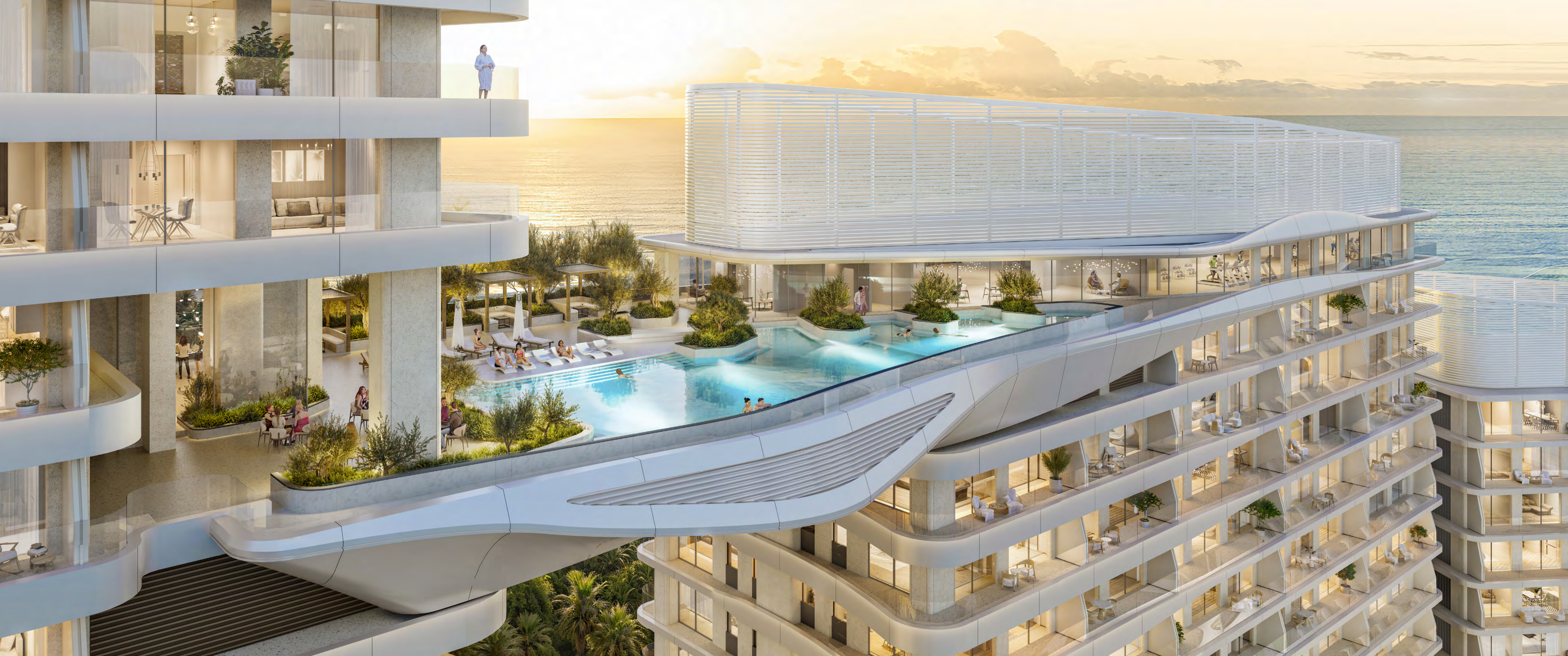
Adult Sky Pool