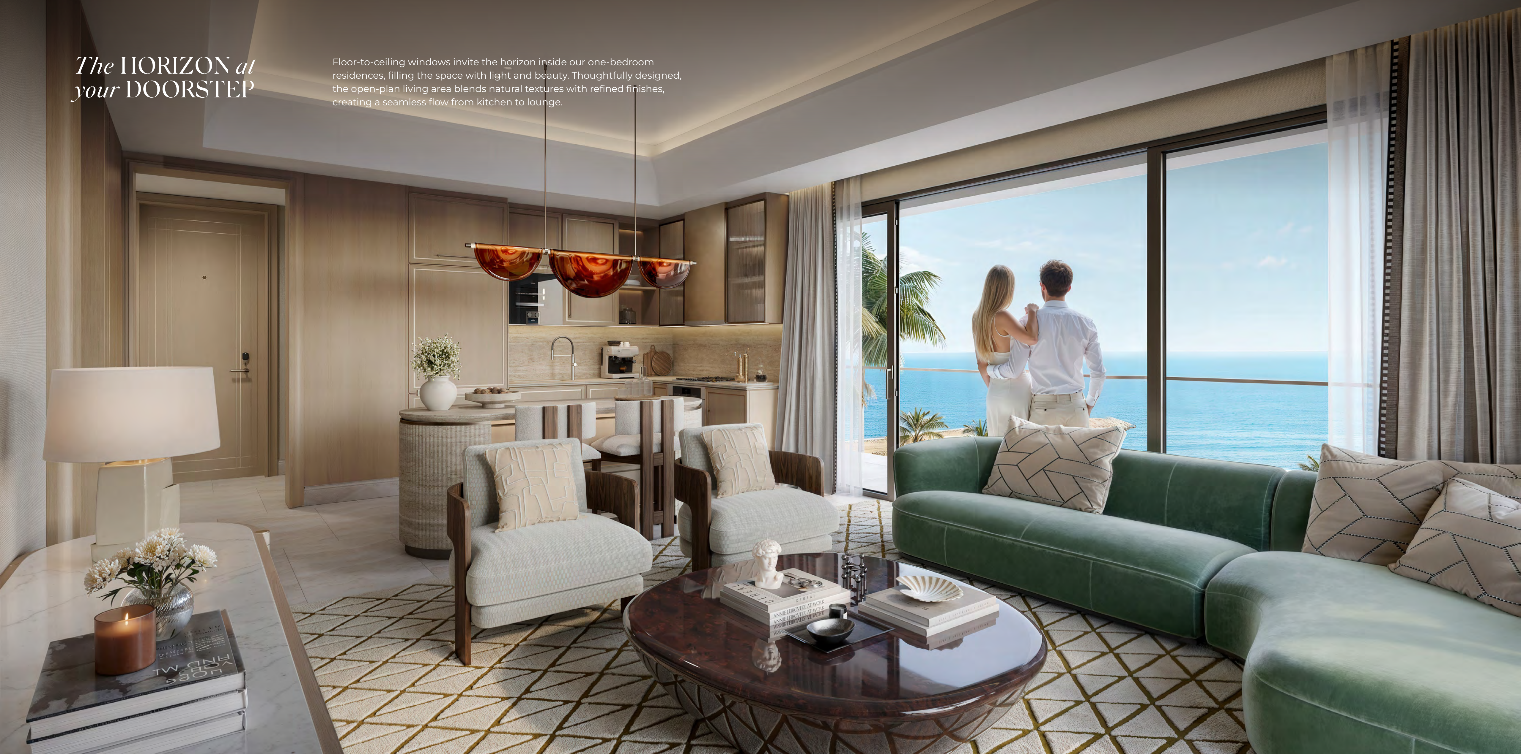
One Bedroom Residences

Floor-to-ceiling windows invite the horizon inside our one-bedroom residences, filling the space with light and beauty. Thoughtfully designed, the open-plan living area blends natural textures with refined finishes, creating a seamless flow from kitchen to lounge.