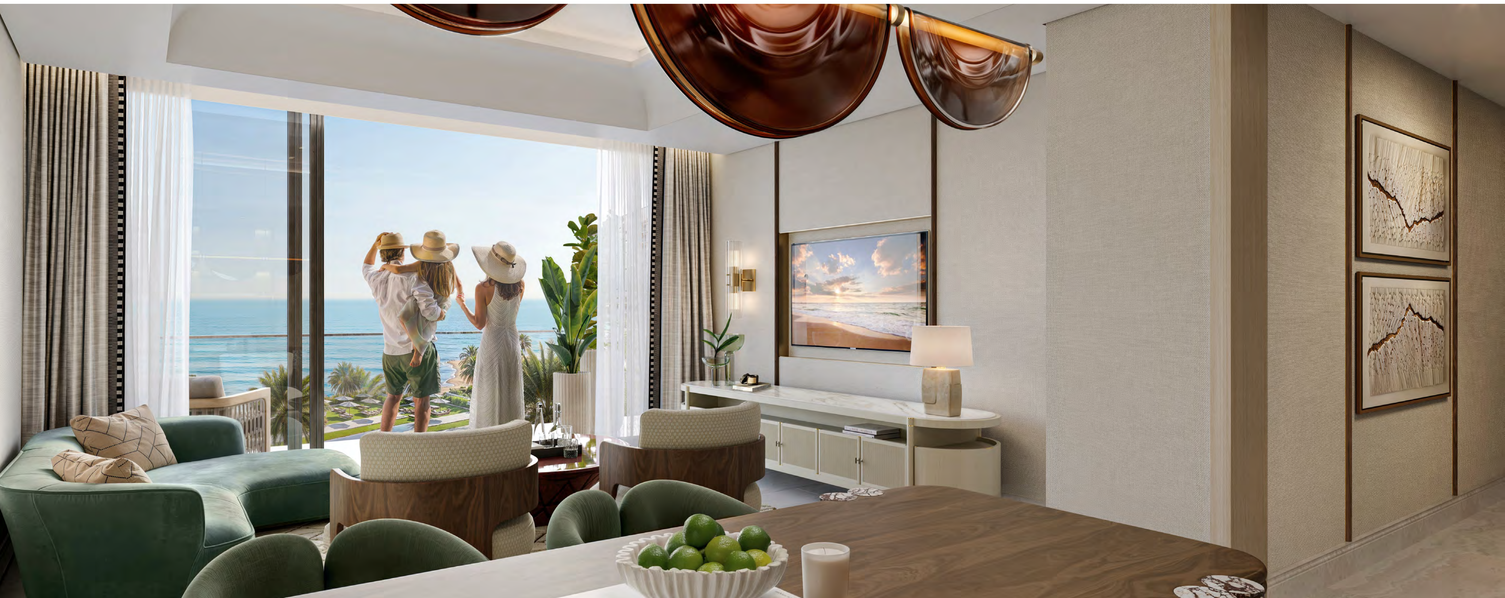
Two Bedroom Residences

Our expansive two-bedroom residences are a masterpiece of balance where space and intimacy coexist in perfect harmony. The sea stretches endlessly before you, a view in constant motion, shifting with the light. Inside, everything speaks of refinement, from the tactile richness of materials to the modern design of the interiors.