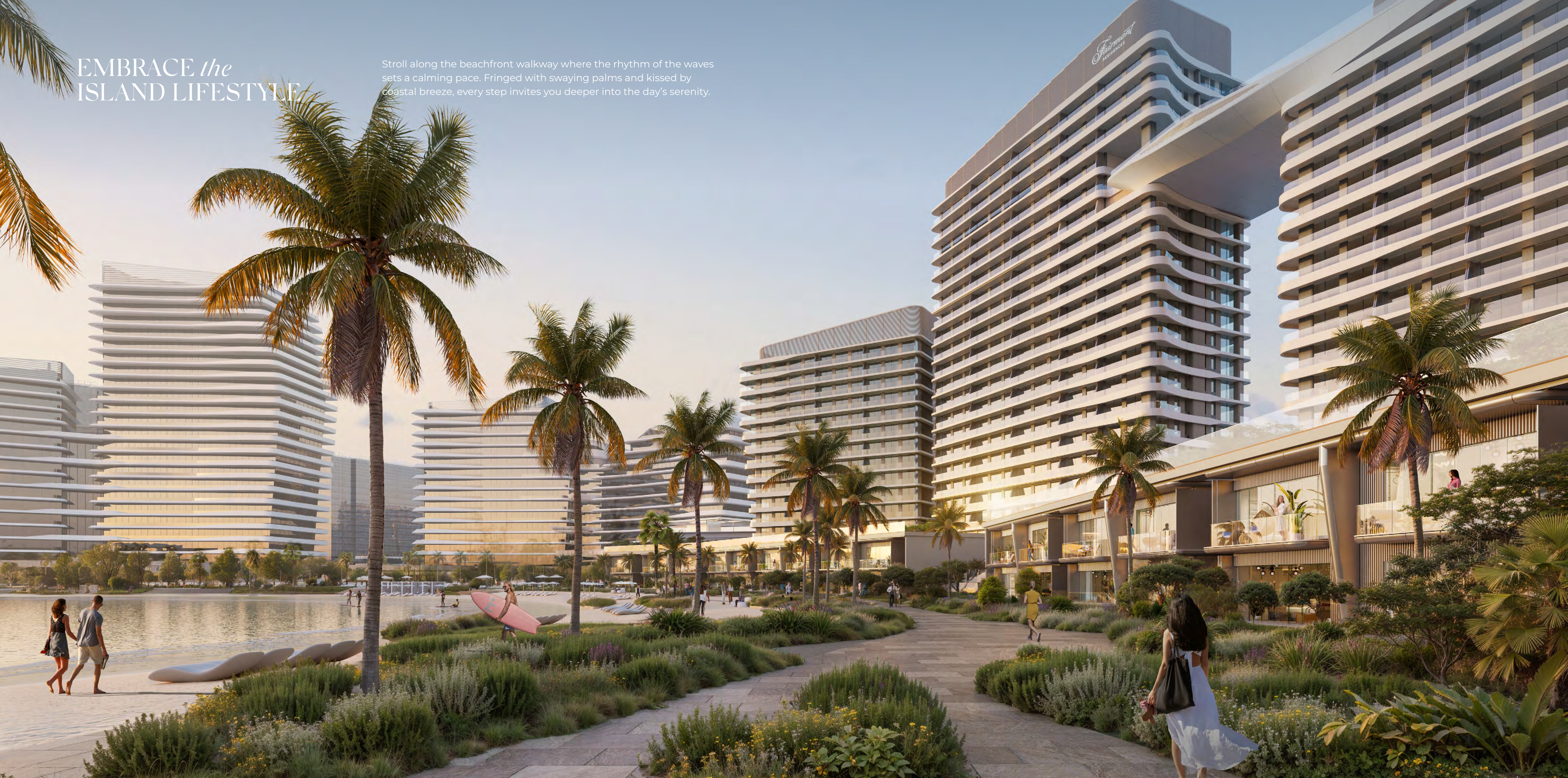
Beach front Walkway

Stroll along the beachfront walkway where the rhythm of the waves sets a calming pace. Fringed with swaying palms and kissed by coastal breeze, every step invites you deeper into the day's serenity.