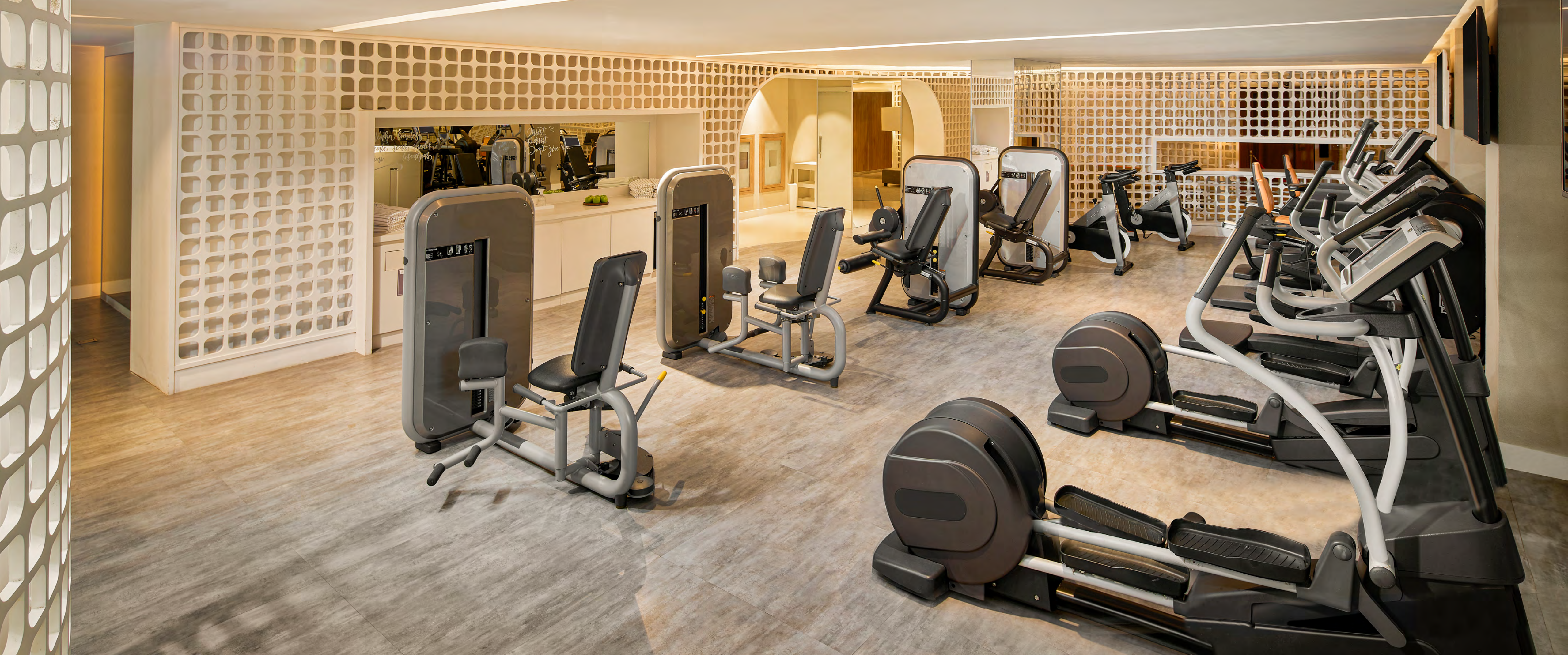
Fairmont Fit Fitness Studio