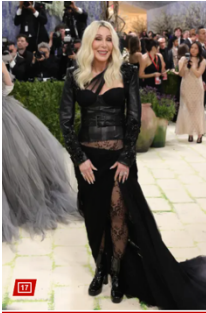
Christina Aguilera had a home in Key Biscayne.