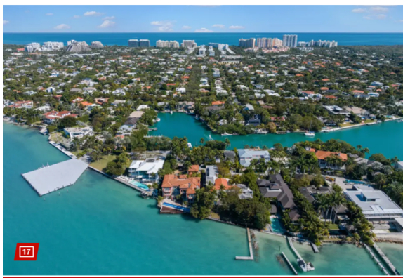
Key Biscayne has become a billionaire's paradise.