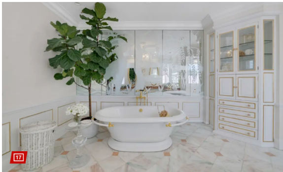
Estrada's Key Biscayne home includes 15 bathrooms and two half-bathrooms. Legendary Productions

Key Biscayne is a 1.25-square-mile island — clocking in at approximately 5 miles long and 1.5 to 2 miles wide — in Miami-Dade County that is home to some 14,000-plus residents. Its composition is two-third parks and one third residential.