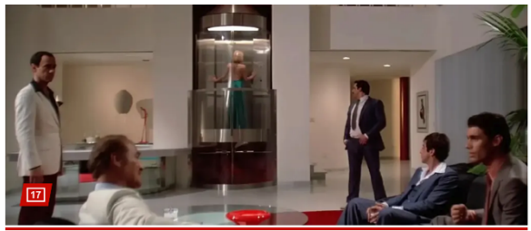
Devaney's residence was used as the fictional home of the drug lord Frank Lopez in "Scarface." Universal Pictures