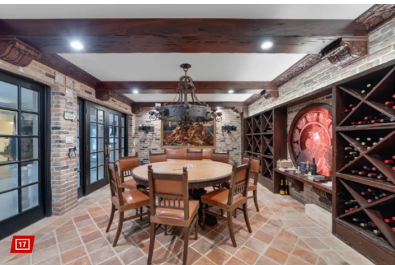
The $125 million listing has wine storage.

And whoever moves in would have some intimate company.