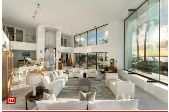
The mansion's glass elevator will be familiar to fans of a certain 1983 movie.