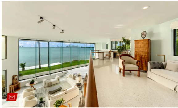
The house fills with light from massive exposures.