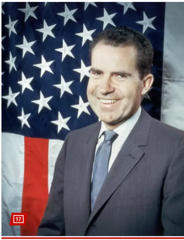
The "Scarface" estate was part of President Richard Nixon's winter White House estate.