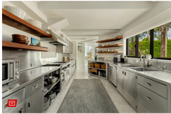
The "Scarface" house has five bedrooms and nine bathrooms.