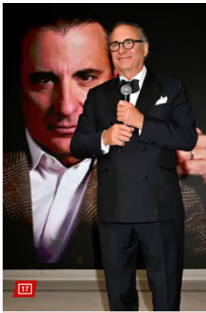
Andy Garcia still has a place in Key Biscayne.