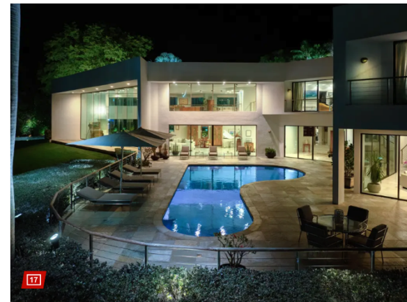
The "Scarface" house is on the market for $237 million. Jill Eber/Judy Zeder/OAK Studios

The median sales price in Key Biscayne has surged 140.51% over the last three years to $2.85 million, per Realtor.com.