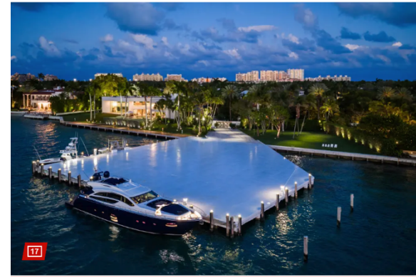
The helipad itself at the "Scarface" house is a roughly 20,000-square-foot concrete platform.