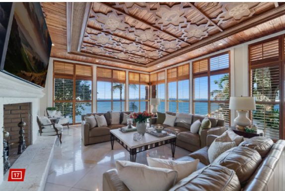
Estrella's house clocks in at over 14,000 square feet. Legendary Productions