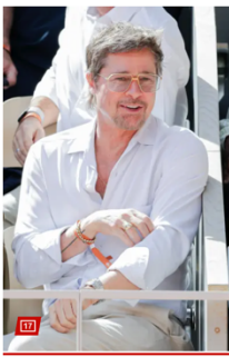
Brad Pitt once owned a home in Key Biscayne.