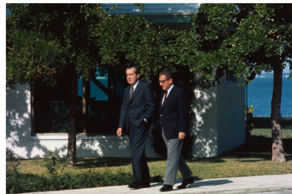
President Richard Nixon and Henry Kissinger walking the grounds of his Key Biscayne compound.