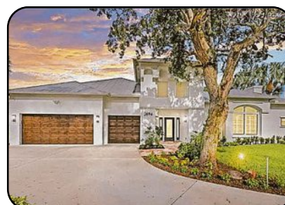
2694 NE Sewalls Landing Way, Jensen Beach, FL 34957 Must See Property Custom-built courtyard pool residence in gated Sewall's Landing $1,495,888