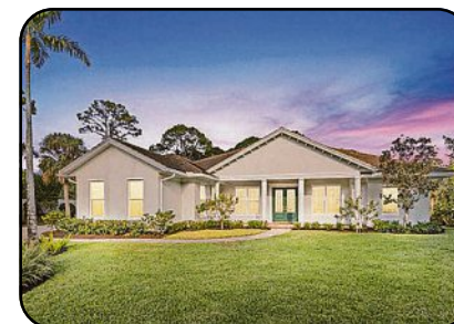
1680 SE Cypress Glen Way, Stuart, FL 34997 Willoughby Golf & Country Club The Smart Luxury Choice $1,089,888