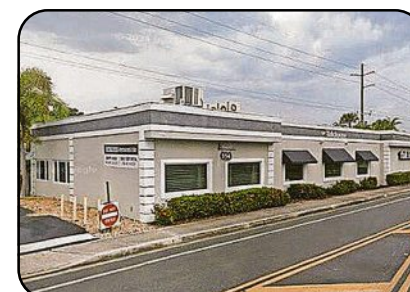
514 NW Dixie Highway Stuart, FL 34994 LOCATION! LOCATION! LOCATION! Extensively renovated in 2017/2018 Commercial Property in City of Stuart $3,000,000