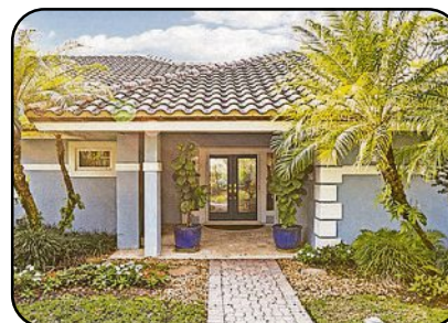
13505 NW Coco Plum Ct., Palm City, FL, 34990 New to Market A rare Harbour Ridge estate with ultimate privacy. $1,595,888