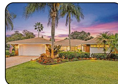
4499 SW Fenwick Lane, Palm City, FL 34990 Like new luxury stunning home. Palm City's premier gated golf and boating community $599,888