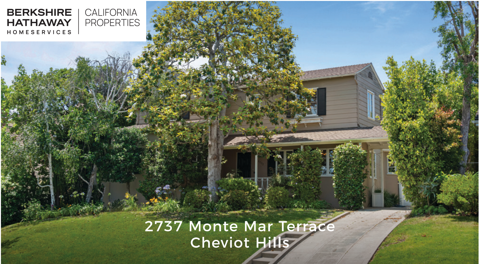
2737 Monte Mar Terrace Cheviot Hills