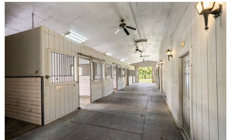
Palm Desert · South Palm Desert 5 Bed + Family Room + Office | 5th Bed currently a Gym 4 Full + 2 Half Bath · 5,411 Sq Ft · 0.69 Acre Lot $3,895,000