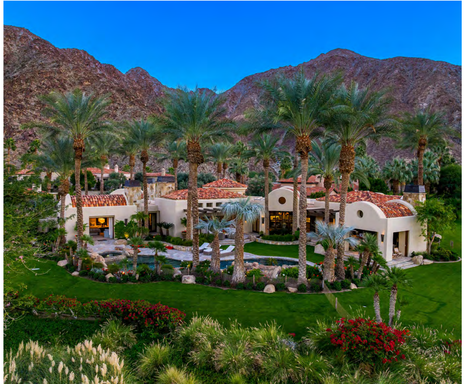
La Quinta · Tradition Golf Club 4 Bed + Media Room/5th Bed + Office 4 Full + 1 Half Bath · 6,439 Sq Ft · .90 Acre Lot $9,650,000 · Furnished · West Facing