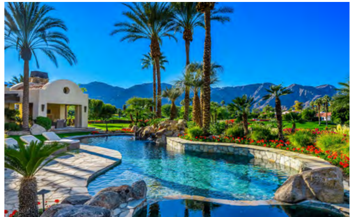
La Quinta · The Hideaway 4 Bed including Casita + Theater + Office 4 Full + 2 Half Baths · 6,098 Sq Ft $7,395,000 · Furnished · West Facing