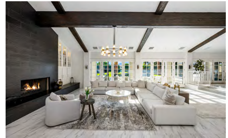
La Quinta · The Hideaway 4 Bed 4 Full + 2 Half Baths · 5,266 Sq Ft $6,395,000 · Furnished