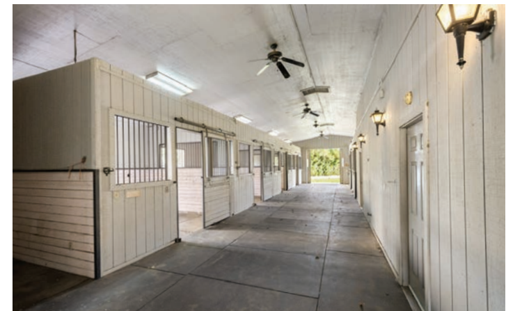
Thermal · Vista Santa Rosa 6 Bed in Main House + 3 Separate Guest Suites 10 Full + 3 Half Bath · 9,131 Sq Ft · 9.29 Acre Lot $6,745,000