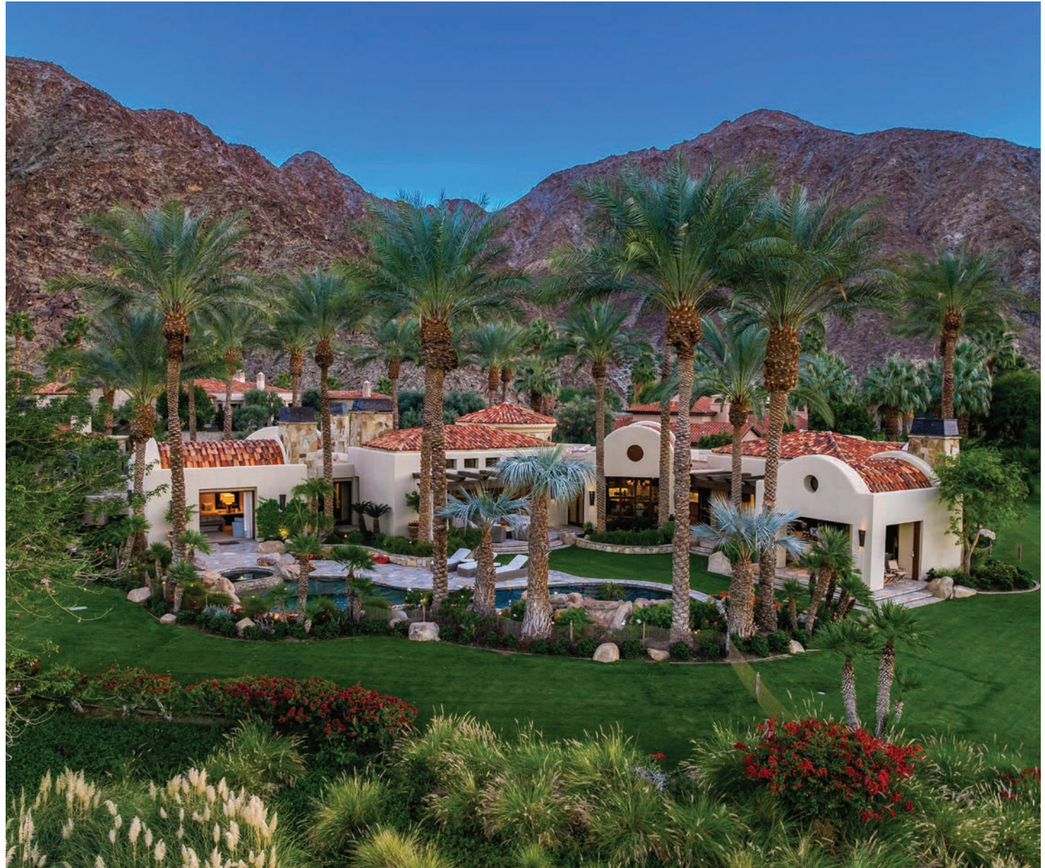
La Quinta · Tradition Golf Club 4 Bed + Media Room/5th Bed + Office 4 Full + 1 Half Bath · 6,439 Sq Ft · .90 Acre Lot $9,650,000 · Furnished · West Facing