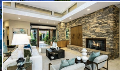
Palm Desert · Bighorn Golf Club 4 Bed including Detached Casita · 4 Full + 1 Half Bath · 3,314 Sq Ft $3,195,000 · North Facing