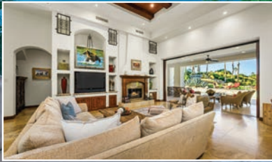
La Quinta · The Hideaway 4 Bed + Detached Office · 4 Full + 1 Half Bath · 4,982 Sq Ft $4,699,000 · Furnished · Northwest Facing