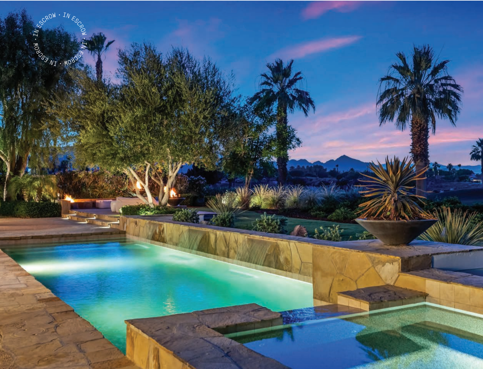
La Quinta · The Hideaway 4 Bed 4 Full + 2 Half Baths · 5,266 Sq Ft $6,395,000 · Furnished