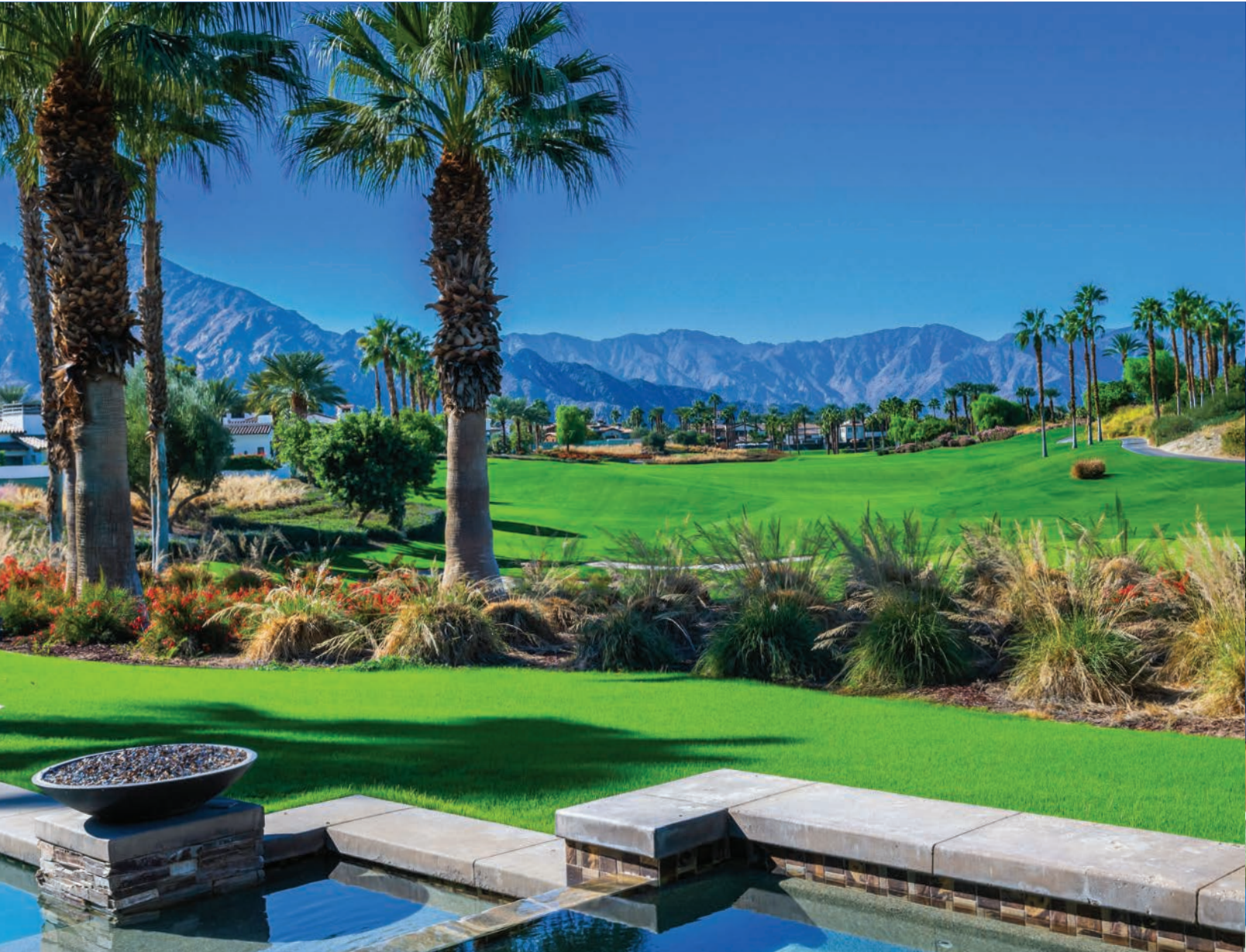
La Quinta · The Hideaway 4 Bed including Casita + Theater + Office 4 Full + 2 Half Baths · 6,098 Sq Ft $7,395,000 · Furnished · West Facing