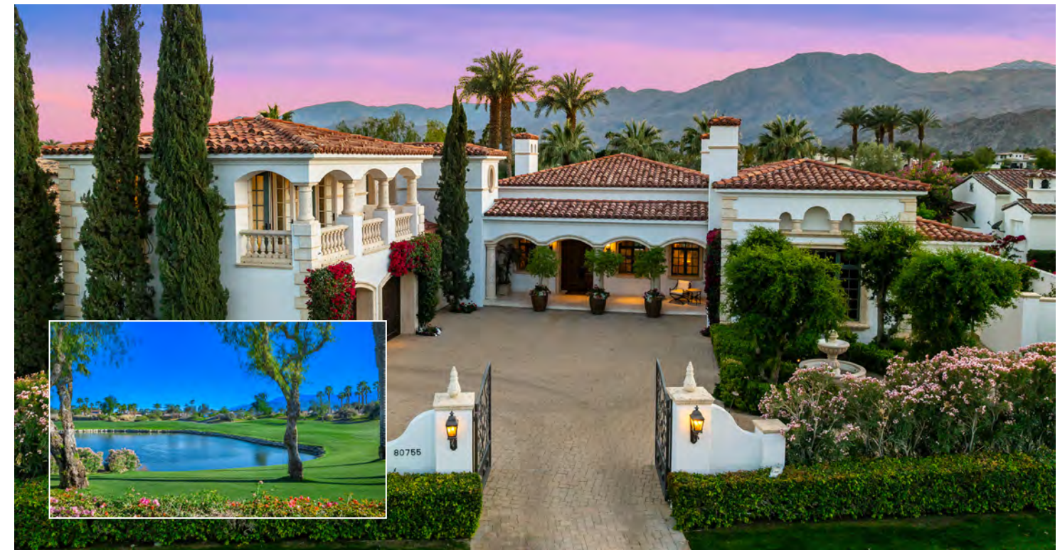
La Quinta · The Hideaway 4 Bed + Media · 4 Full + 1 Half Bath · 5,279 Sq Ft $5,950,000 · Furnished and South Facing