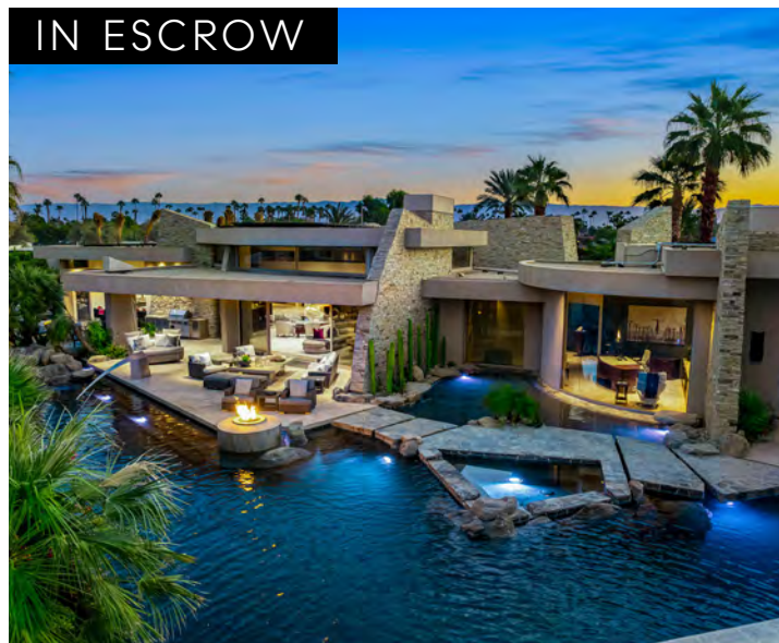
Rancho Mirage 5 Bed · 6 Full + 2 Half Bath · 10,019 Sq Ft · 2 Acre Lot $7,995,000 · Furnished