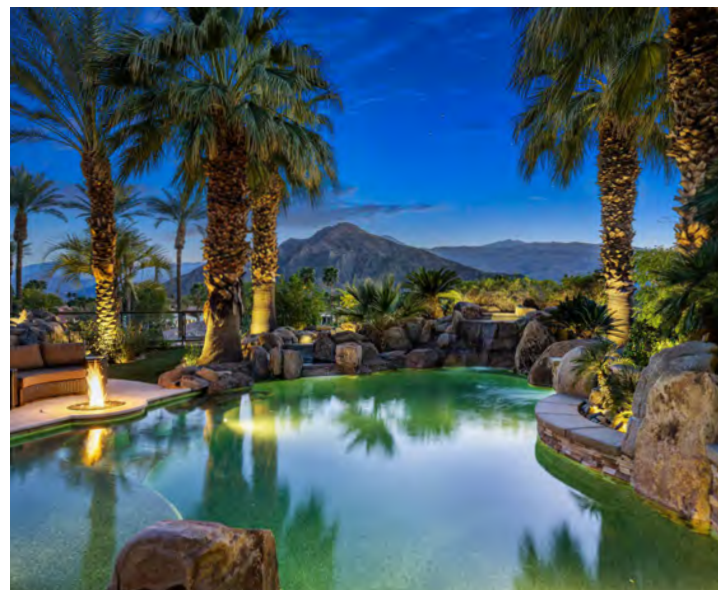
La Quinta · The Estancias at Rancho La Quinta 4 Bed · 4 Full + 2 Half Bath · 5,123 Sq Ft $3,995,000 · Furnished