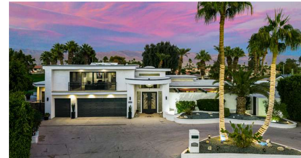
42580 CABALLEROS DRIVE, BERMUDA DUNES · BDCC COUNTRY 4 Bed · 4 Full Bath · 4,868 Sq Ft · 0.25 Acre Lot $1,495,000 · Furnished