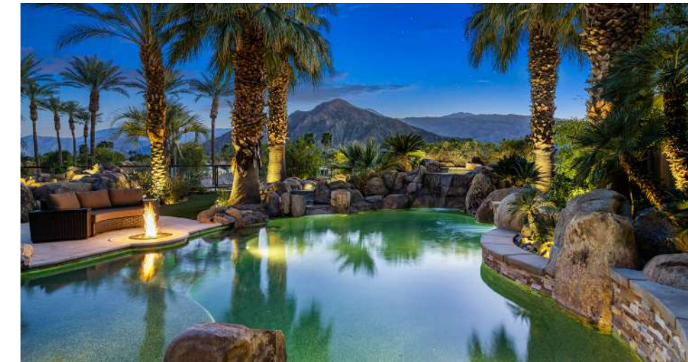
50490 ORCHARD LANE, LA QUINTA · THE ESTANCIAS RANCHO LQ 4 Bed · 4 Full Bath · 2 Half Bath · 5,123 Sq Ft · 0.68 Acre Lot $3,995,000 · Furnished