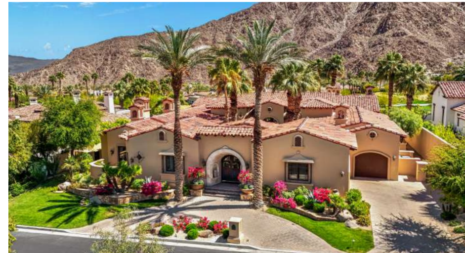
53330 DEL GATO DRIVE, LA QUINTA · TRADITION GOLF CLUB 4 Bed · 4 Full Bath · 1 Half Bath · 4,717 Sq Ft · 0.42 Acre Lot $4,670,000