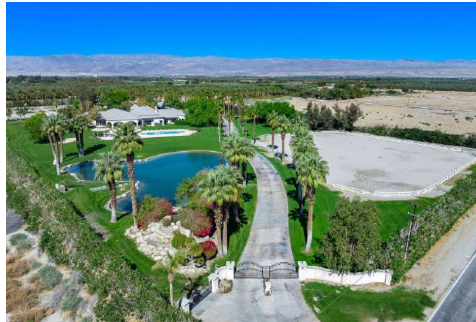
82820 AVENUE 54, THERMAL · VISTA SANTA ROSA 10 Bed · 10 Full Bath · 3 Half Bath · 9,131 Sq Ft · 9.24 Acre Lot $7,495,000