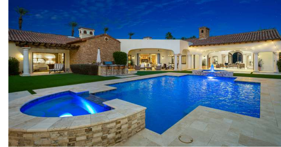
12 STRAUSS TERRACE, RANCHO MIRAGE · THE RENAISSANCE 5 Bed · 7 Full Bath · 1 Half Bath · 7,480 Sq Ft · 1.31 Acre Lot $4,995,000 · Furnished