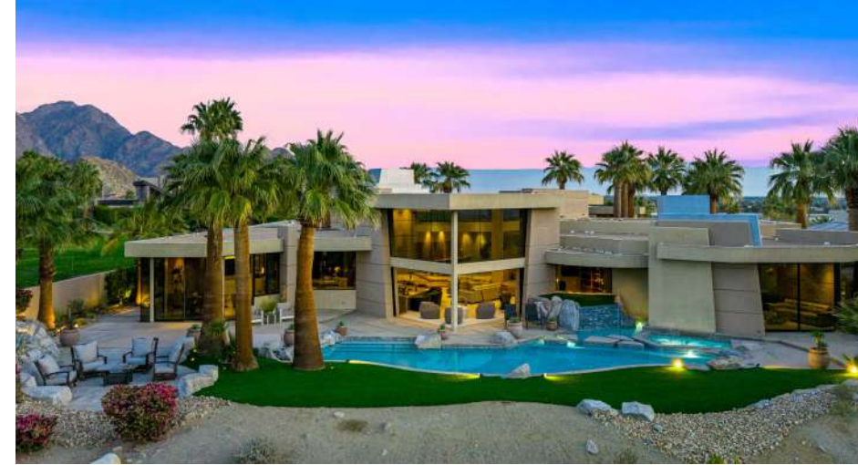
79525 TOM FAZIO LANE N, LA QUINTA · THE QUARRY 3 Bed · 3 Full Bath · 2 Half Bath · 6,442 Sq Ft · 0.61 Acre Lot $5,895,000 · Furnished