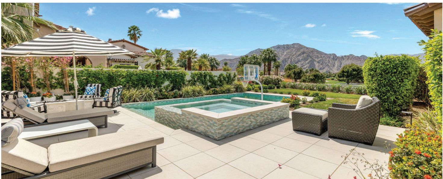
La Quinta · The Hideaway 4 Bed · 4 Full + 1 Half Bath · 3,001 Sq Ft $3,495,000 · Furnished