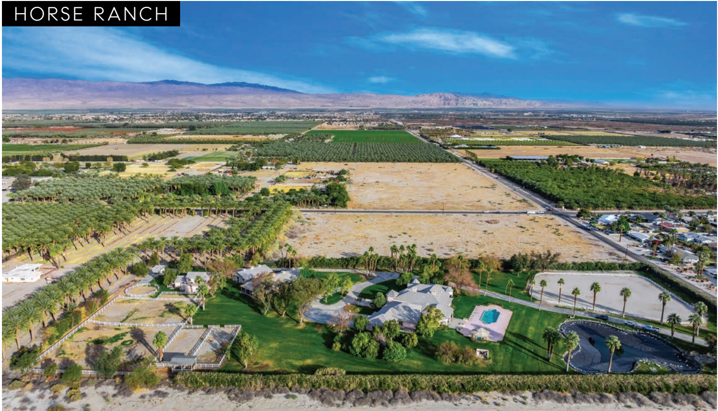
Thermal · Vista Santa Rosa 6 Bed in Main House + 3 Separate Guest Suites · 10 Full + 3 Half Bath · 9,131 Sq Ft · 9.29 Acre Lot $6,995,000