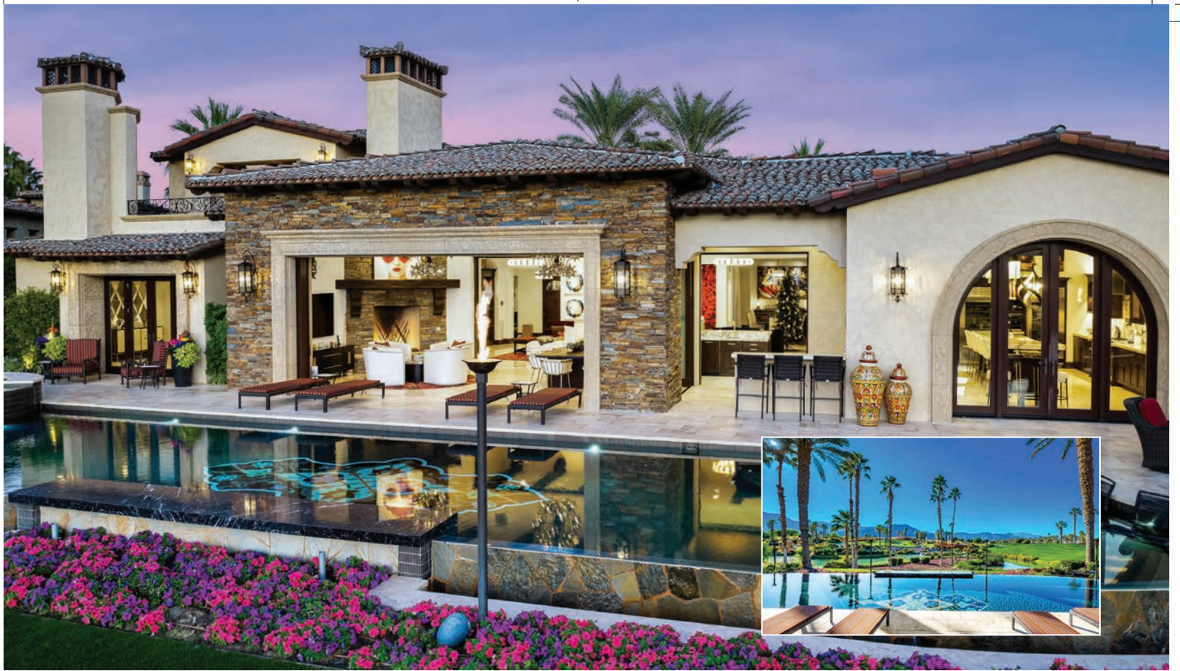
La Quinta · The Hideaway 6 Bed · 7 Full + 1 Half Bath · 7,810Sq Ft $7,995,000 · Furnished