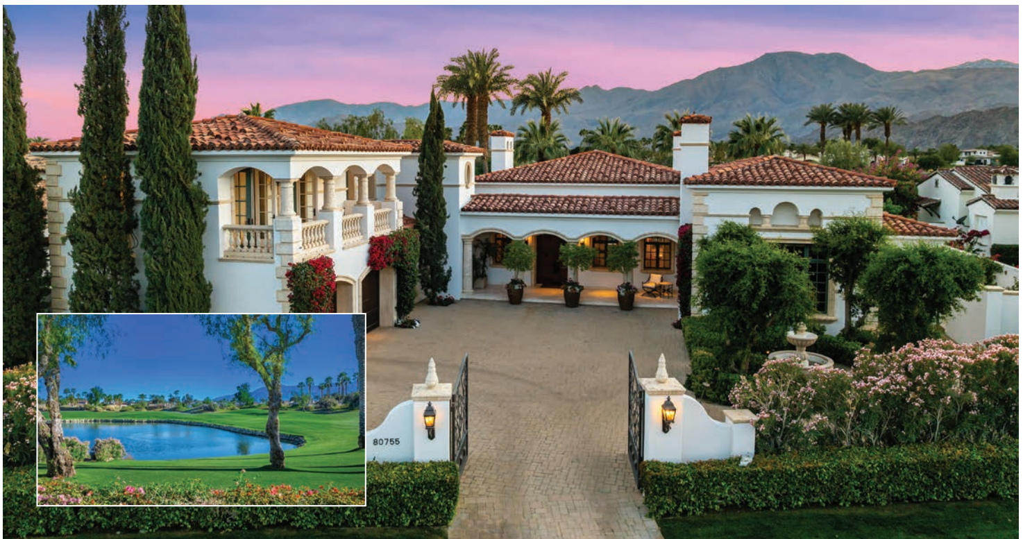
La Quinta · The Hideaway 4 Bed + Media · 4 Full + 1 Half Bath · 5,279 Sq Ft $5,750,000 · Furnished and South Facing