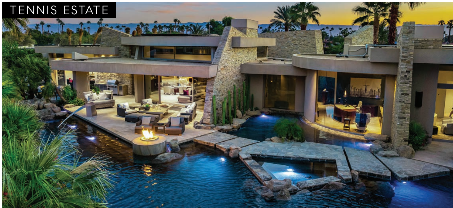
Rancho Mirage 5 Bed | 6 Full + 2 Half Bath | 10,019 Sq Ft | 2 Acre Lot $8,860,000 | Furnished