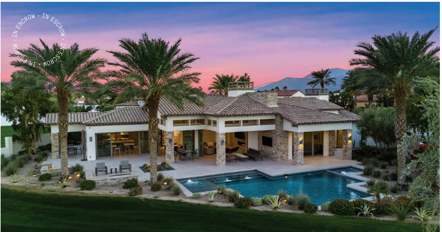
La Quinta 4 Bed | 4 Full + 2 Half Bath | 4,055 Sq Ft $4,800,000 | Furnished