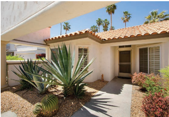
155 Desert Falls Drive East 3 BD 2 BA 1 Half BA 1,814 SF $620,000 Furnished