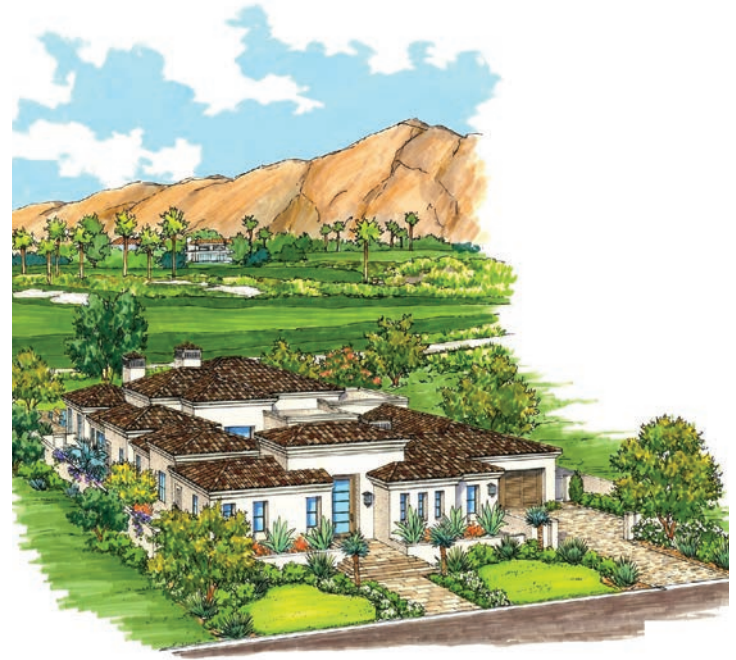
La Quinta 5 Bed · 5 Full + 2 Half Bath · 5,458 Sq Ft $6,595,000 · Furnished