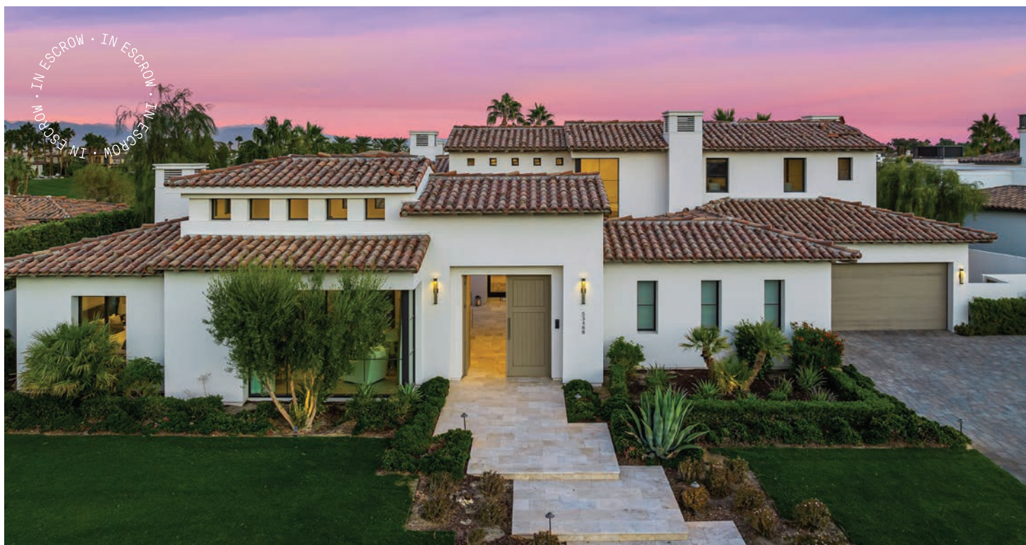
La Quinta 5 Bed · 6 Full + 1 Half Bath | 6,298 Sq Ft $7,398,000 · Furnished