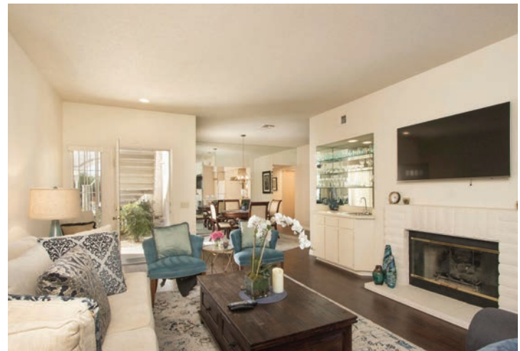
610 Vista Lago Circle North 2 BD 2 BA 1 Half BA 1,360 SF $375,000 Furnished

Desert Falls' moderate HOA dues, and prime location make it an extremely desirable community. Condominiums from mid $350,000's, single family homes from $699,900, and estate homes from $2,350,000.