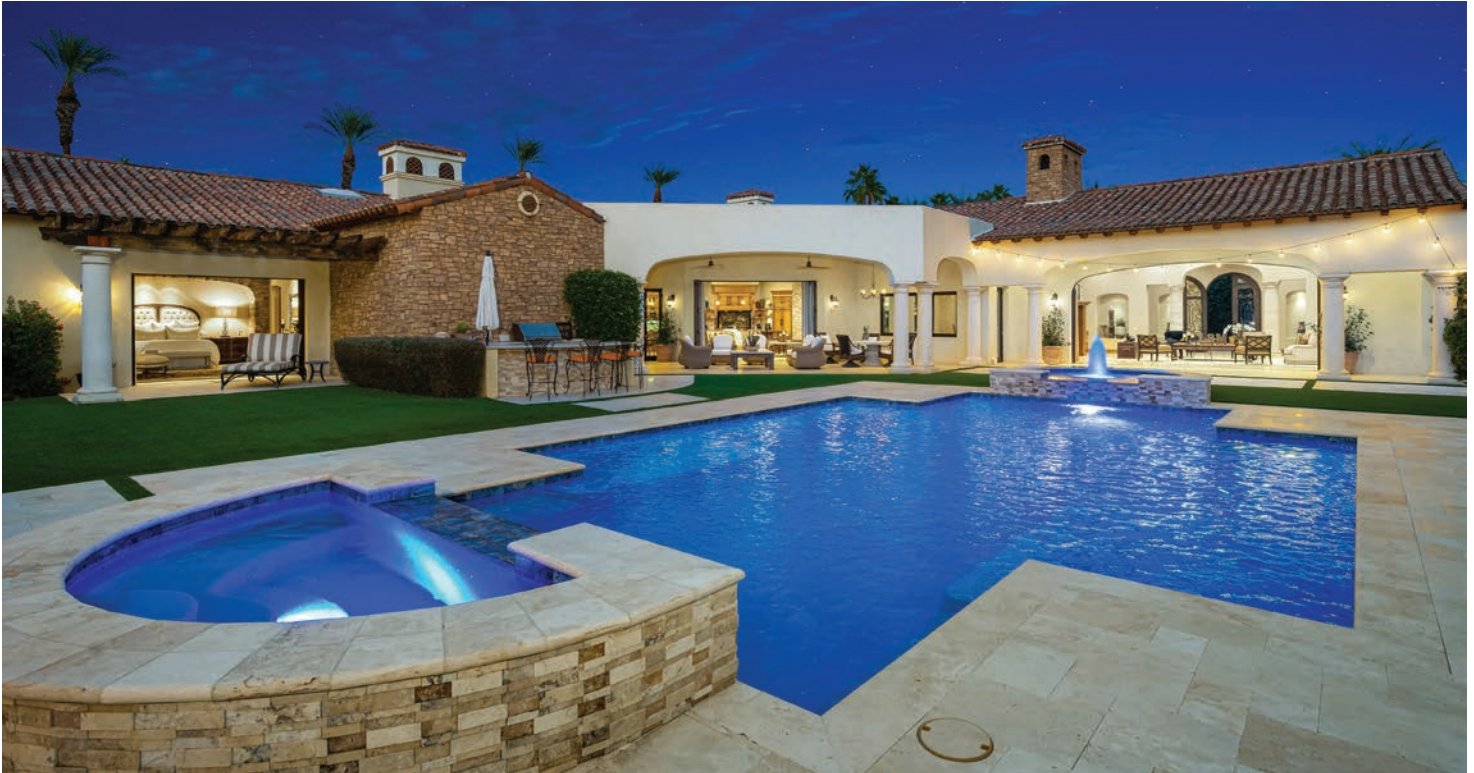
Rancho Mirage 5 Bed | 7 Full + 1 Half Bath | 7,480 Sq Ft | 1.31 Acre Lot $5,195,000 | Furnished