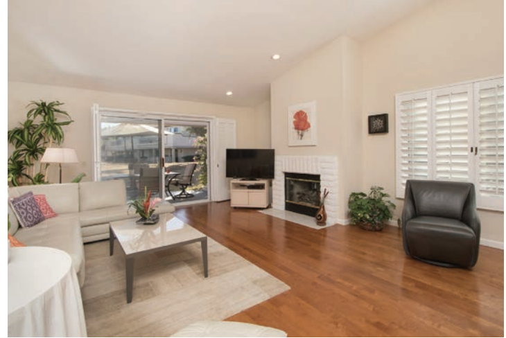
796 Montana Vista Drive 2 BD + DEN 2 BA 1 Half BA 1,814 SF $640,000 Furnished