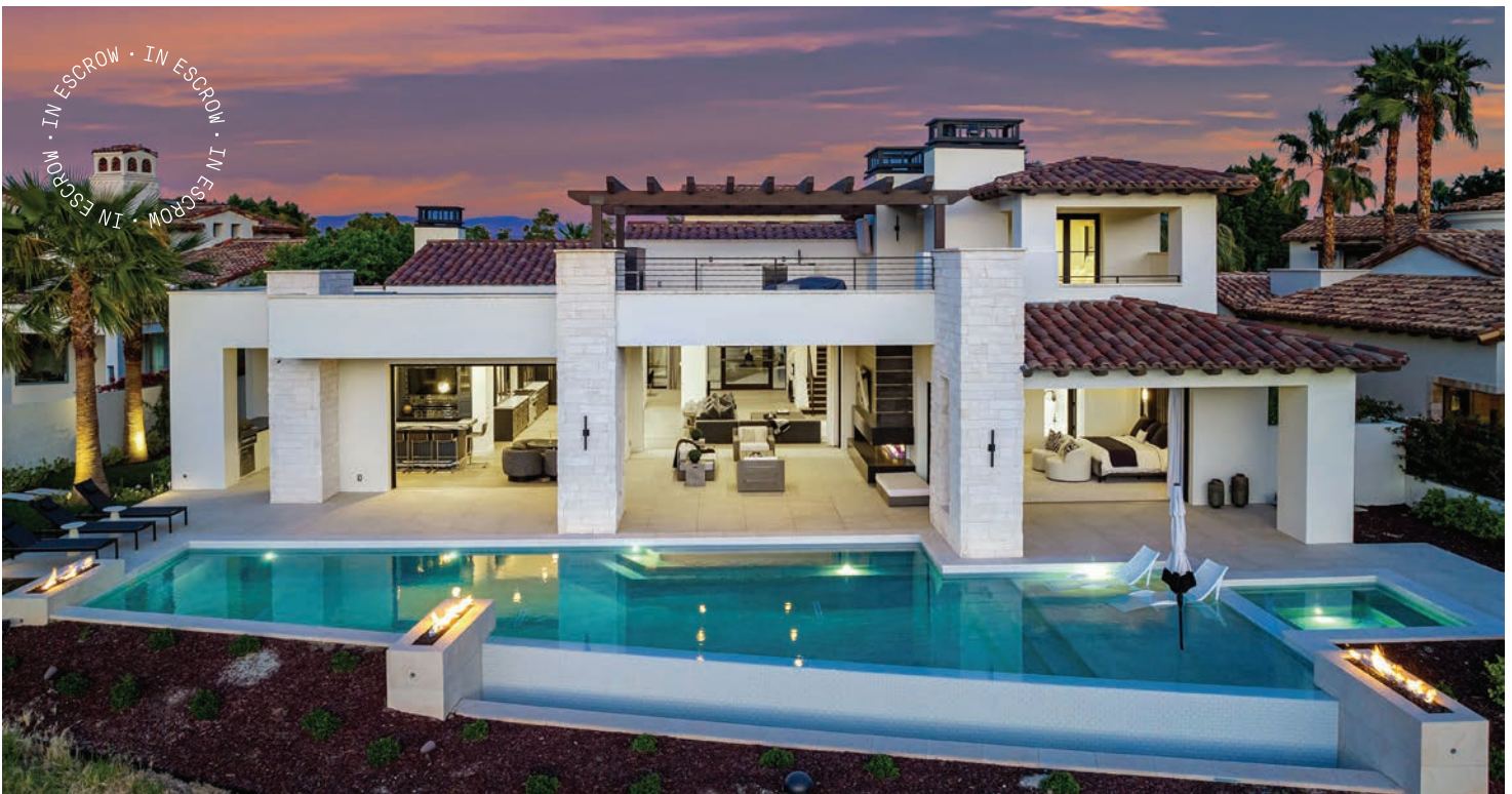
La Quinta · The Hideaway 4 Bed · 4 Full + 1 Half Bath | 5,100 Sq Ft $6,500,000 · Furnished