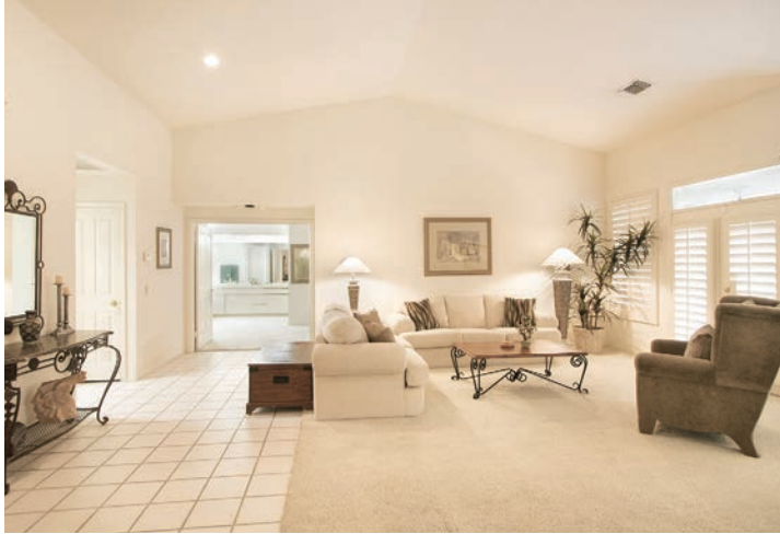
373 Links Drive 4 BD 2 BA 2 Half BA 2,552 SF $699,900 Furnished

Selling or Buying? Contact Linda Livingston.