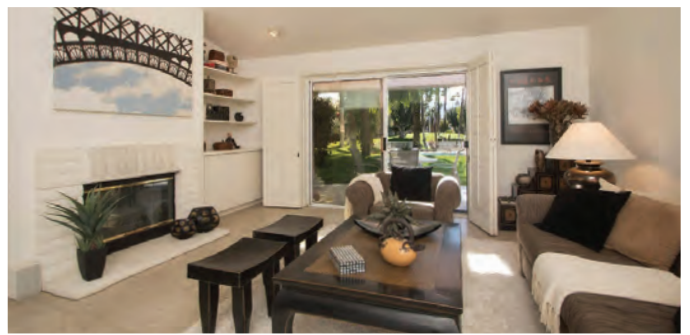
794 Montana Vista Drive 3 BD 2 BA 1 Half BA 1,814 SF $590,000 Furnished