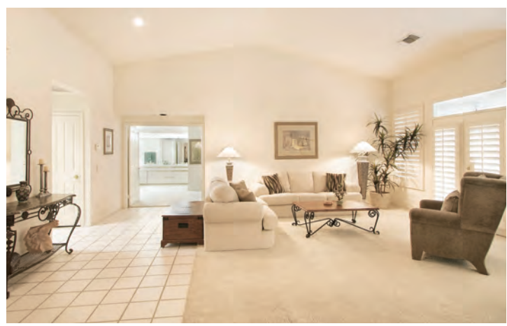
373 Links Drive 4 BD 2 BA 2 Half BA 2,552 SF $699,900 Furnished