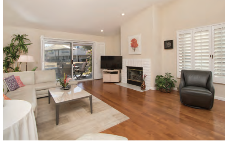
796 Montana Vista Drive 2 BD + DEN 2 BA 1 Half BA 1,814 SF $640,000 Furnished