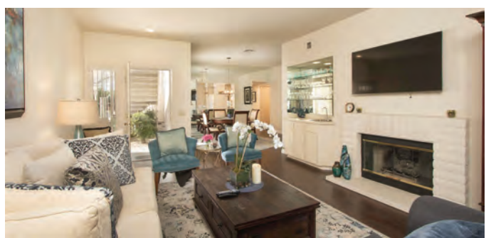
610 Vista Lago Circle North 2 BD 2 BA 1,360 SF $375,000 Furnished

Desert Falls' moderate HOA dues, and prime location make it an extremely desirable community. Condominiums from mid $350,000's, single family homes from $699,900, and estate homes from $2,350,000.