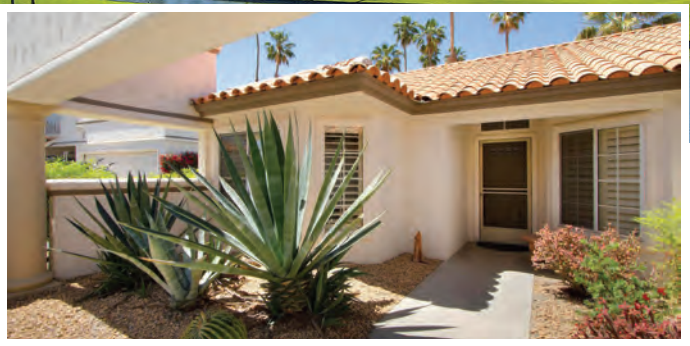
155 Desert Falls Drive East 3 BD 2 BA 1 Half BA 1,814 SF $620,000 Furnished

Selling or Buying? Contact Linda Livingston.