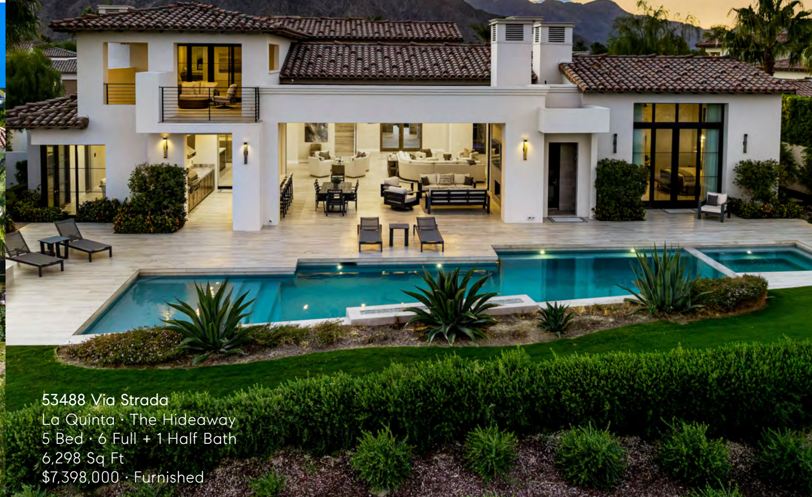
53488 Via Strada La Quinta · The Hideaway 5 Bed · 6 Full + 1 Half Bath 6,298 Sq Ft $7,398,000 · Furnished