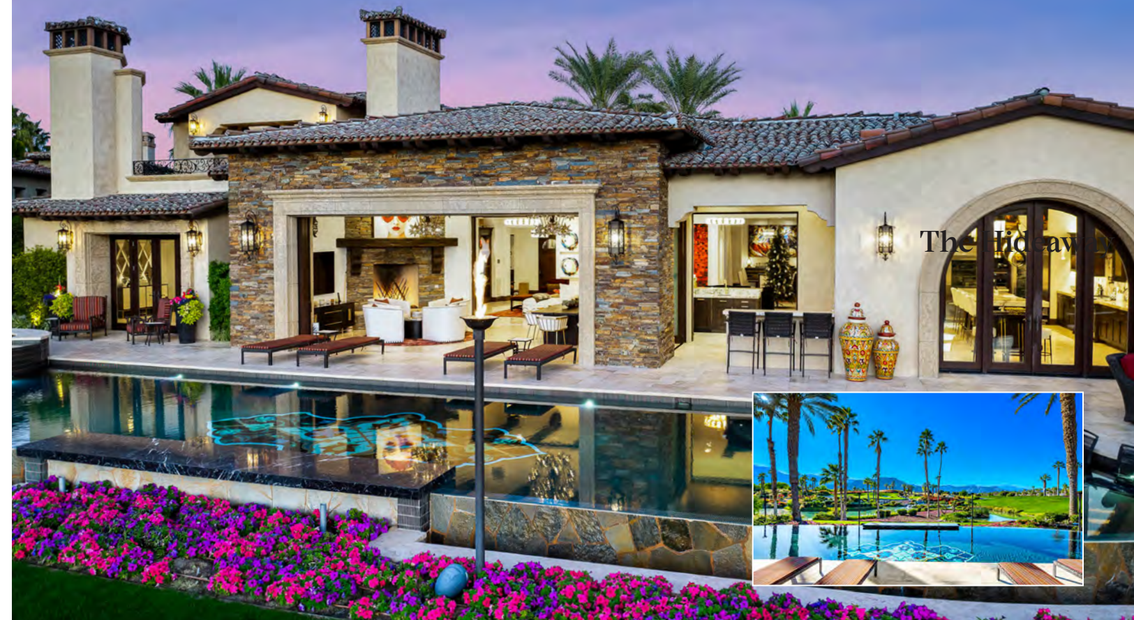
La Quinta · The Hideaway 6 Bed · 6 Full + 2 Half Bath · 7,810Sq Ft $7,995,000 · Furnished