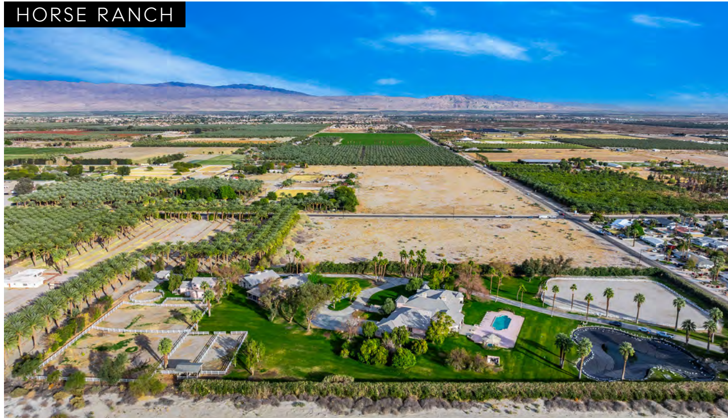
Thermal · Vista Santa Rosa 6 Bed in Main House + 3 Separate Guest Suites · 10 Full + 3 Half Bath · 9,131 Sq Ft · 9.29 Acre Lot $6,995,000