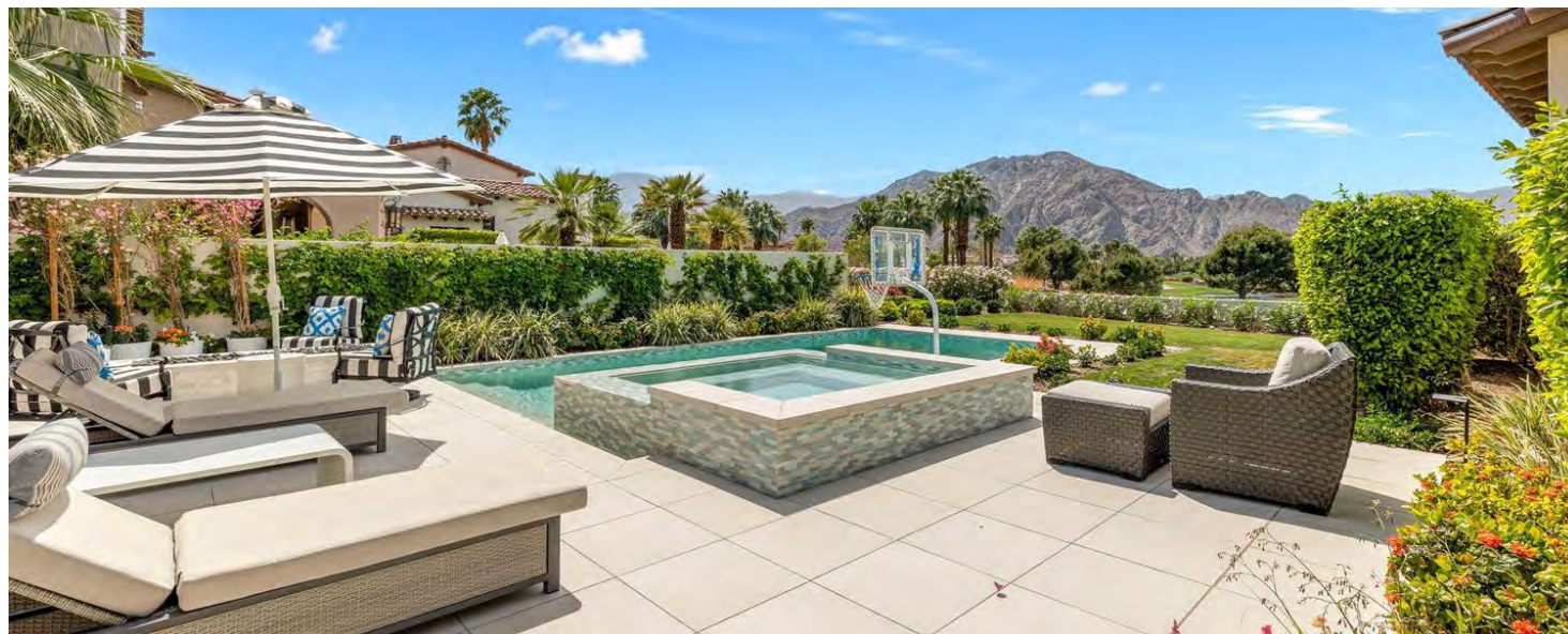
La Quinta · The Hideaway 4 Bed · 4 Full + 1 Half Bath · 3,001 Sq Ft $3,495,000 · Furnished