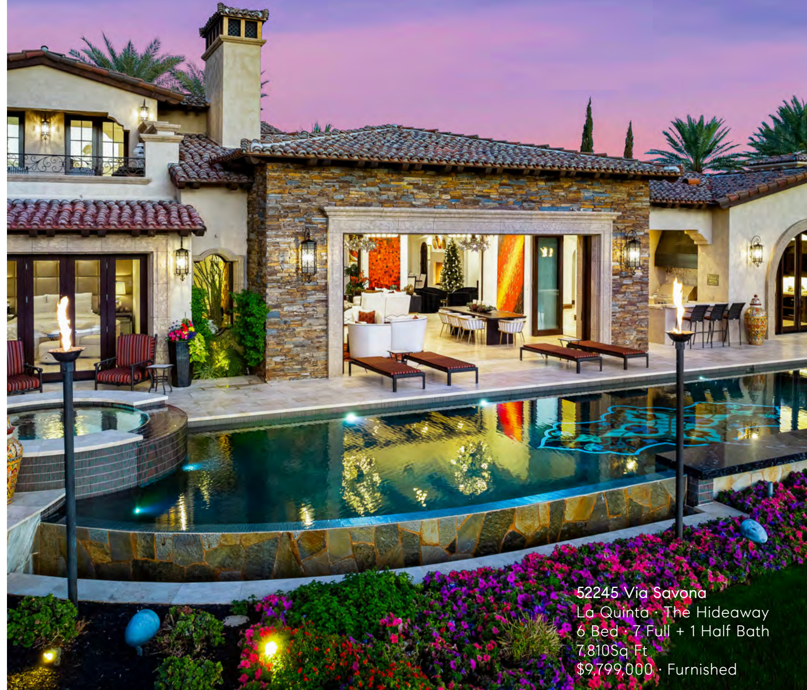
52245 Via Savona La Quinta · The Hideaway 6 Bed · 7 Full + 1 Half Bath 7,810 Sq Ft $9,799,000 · Furnished