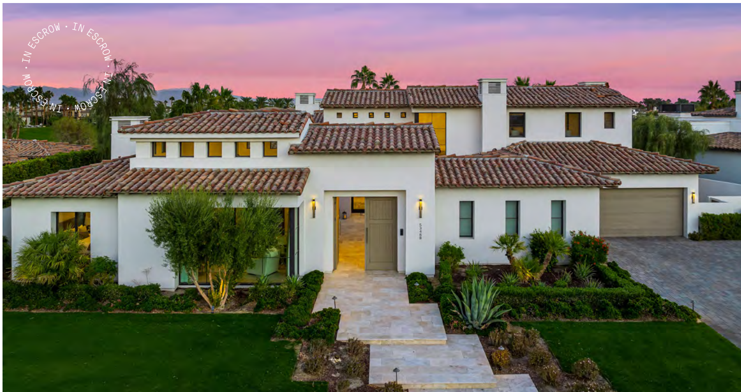
La Quinta 5 Bed · 6 Full + 1 Half Bath | 6,298 Sq Ft $7,398,000 · Furnished