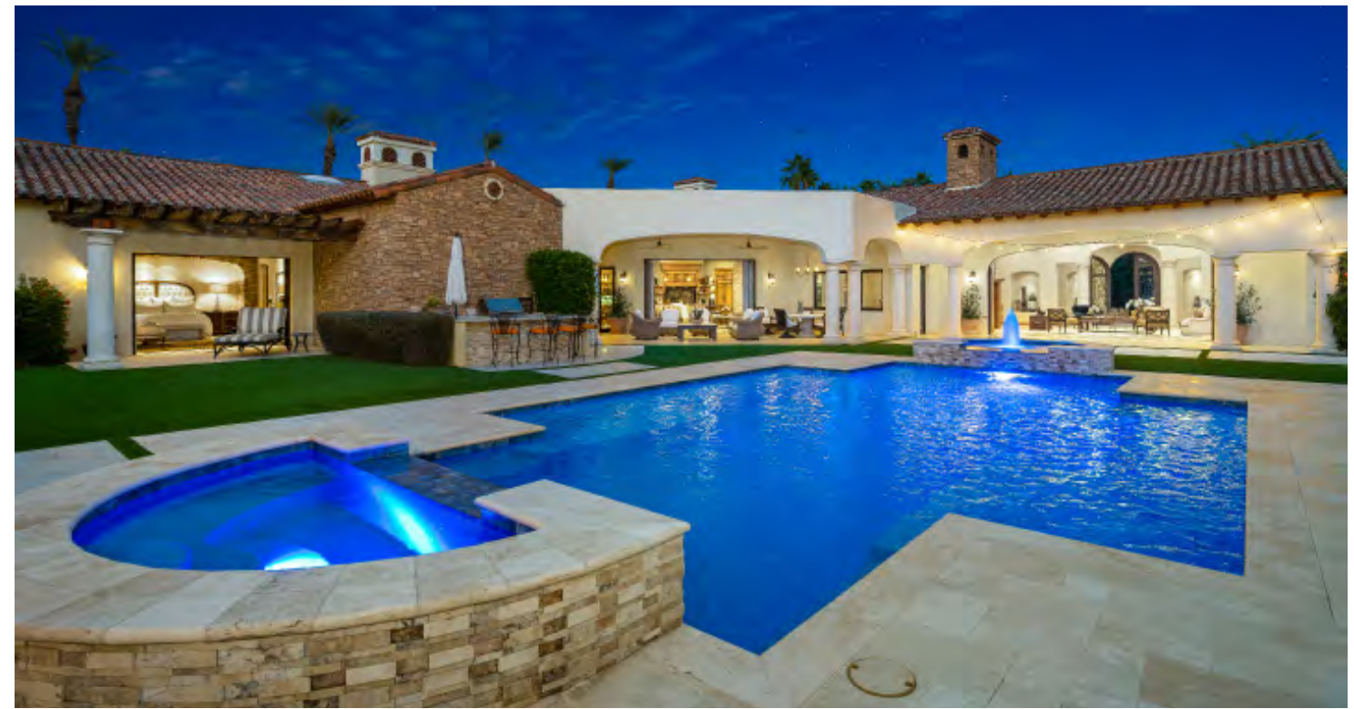
Rancho Mirage 5 Bed | 7 Full + 1 Half Bath | 7,480 Sq Ft | 1.31 Acre Lot $5,195,000 | Furnished