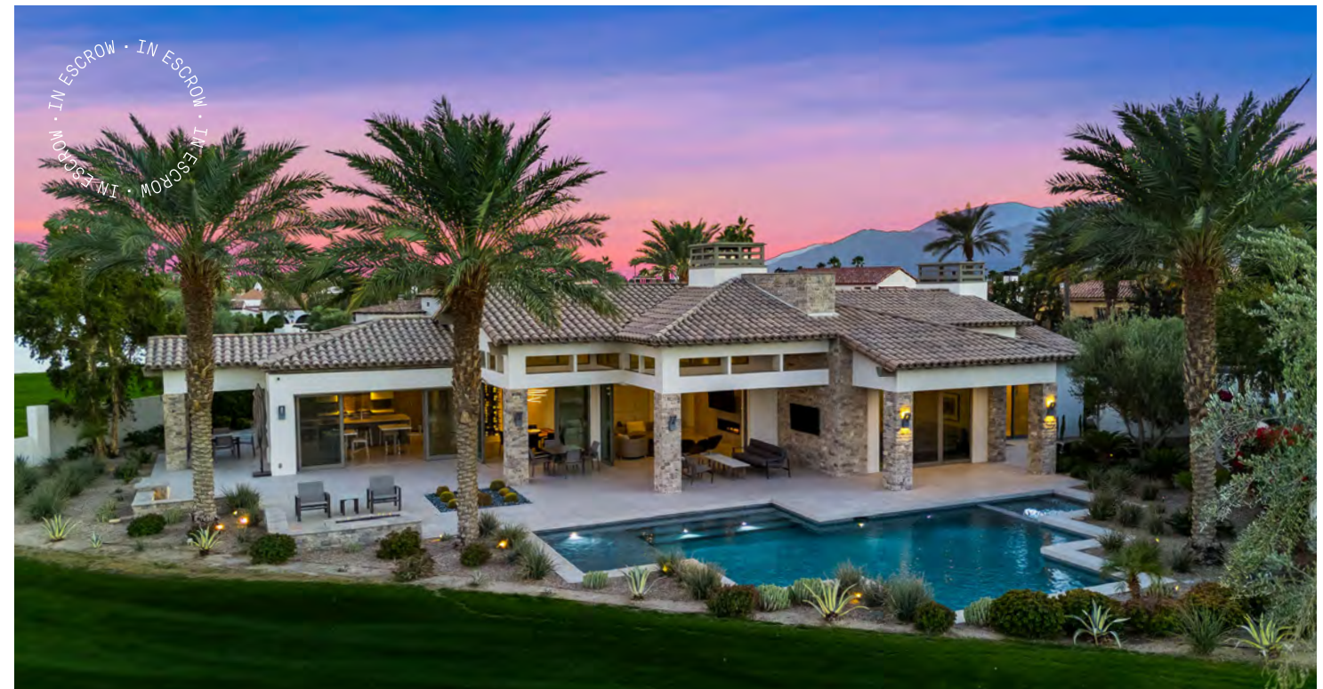
La Quinta 4 Bed | 4 Full + 2 Half Bath | 4,055 Sq Ft $4,800,000 | Furnished